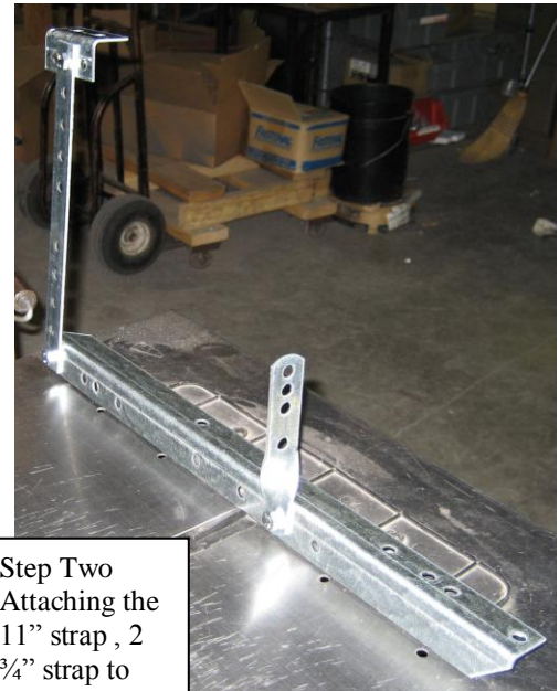
Step Two Attaching the 11" strap , 2 3/4" strap to the 20" bracket

SBR161 95-Current Chevy Astro GMC Safari