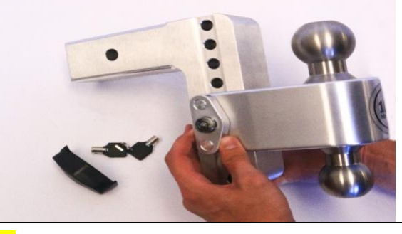
STEP 2: Place the <u>180 Slider</u> at the desired drop on the <u>Drawbar (C)</u> to ensure that your vehicle and trailer are properly positioned.

STEP 4: Pull on the <u>Key Lock Assembly</u> to ensure that it has engaged and place the <u>Dust Lock Cover (E)</u> over the lock. Do not operate without making sure the <u>Key Lock</u> <u>Assembly</u> is securely locked in place.