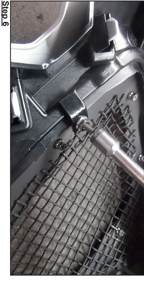
Secure grille studs with the included brackets and locknut's