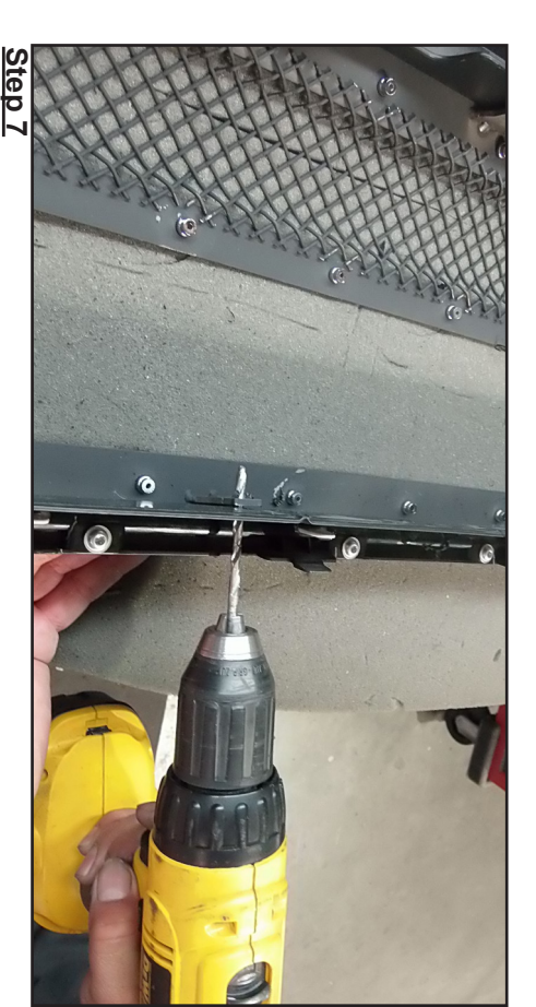
Drill 3/16" holes into the grille shell, use the hole on the new grille as a guide. Secure the new grille to the factory grille shell with the supplied screws and flat nuts.