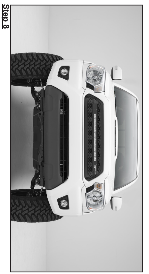
Re-install LED light bar into grille. Your installation is now complete. Reattach the grille assembly back to the vehicle in reverse order of removal. Make sure you reconnect and reattach all hamesses, clips and screws. Wire the LED Light Bar via our optional wiring harness kit (par# 639HAR1) or custom wiring harness.