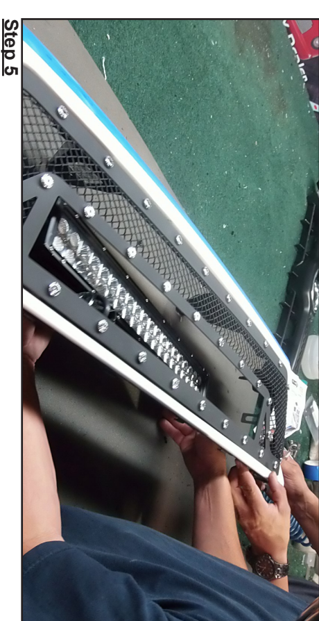
Remove the pre-installed LED light bar from the grille

PLEASE READ AND UNDERSTAND ALL INSTRUCTIONS BEFORE INSTALLATION. Auto makers offer varied models to each vehicle and occasionally manufacture more than one body style of the same model. To assure your part is correct; our tech department can be contacted at tech@ trexbillet.com to verify fitment or assist with tech questions. All other inquires can be directed to info@trexbillet.com. In the event you do not have internet access please call 1-800-287-5900. NOTE. We recommend painting all areas exposed behind grille black prior to installing for best results.