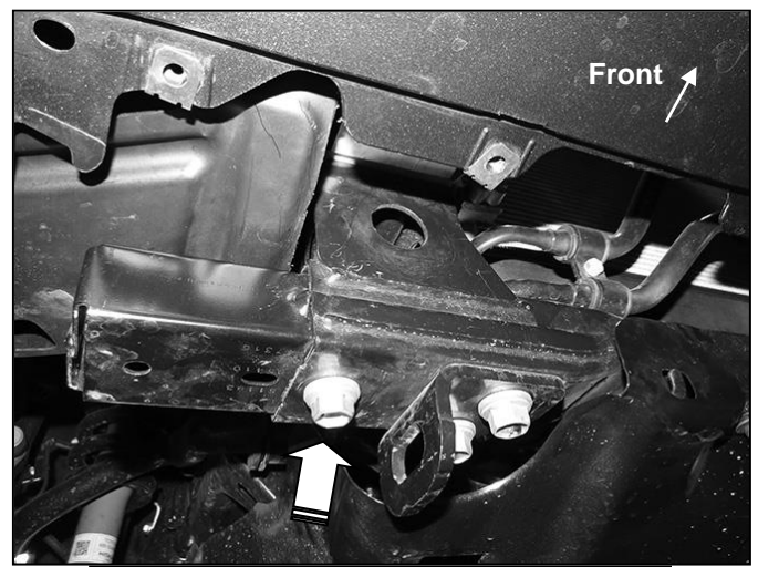
(Fig 2) Remove factory hex bolt (arrow)