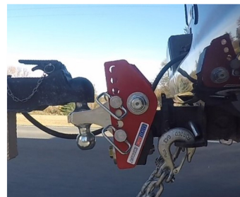
Figure 2: Set up for rise - bump cushions facing ground