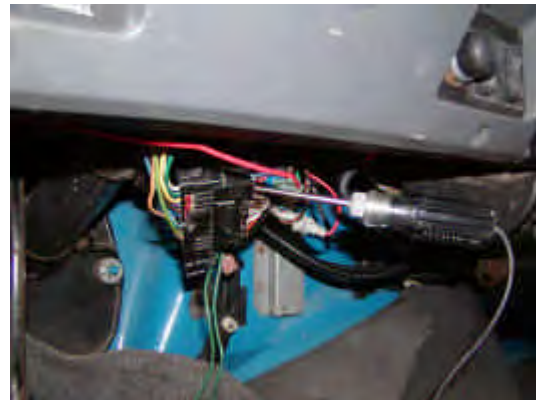
Figure 7. Locate and determine the wires needed. A wiring diagram and/or test light will be helpful.