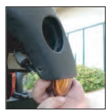
Figure 2b Figure 2c