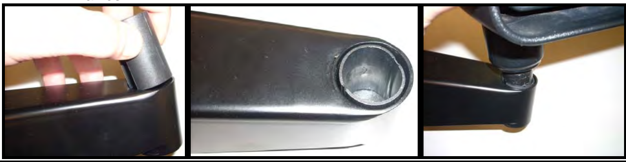
Step 7: Repeat steps 1-6 for the opposite side.

NOTE: To ease installation of the mirror head the insert can be cut into two separate halves.