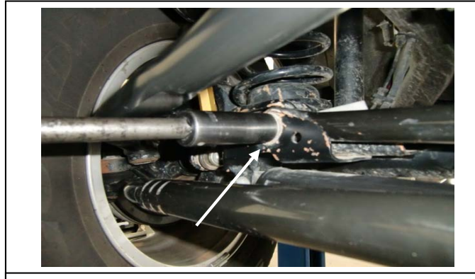
With vehicle on level ground, remove track bar bolt at axle.

The Bill of Materials represents the component contents of this kit. All hardware is of the highest grade and the components are manufactured to exacting specifications for a trouble free installation. Use the attached torque specifications chart when final tightening of the nut and bolts are done.