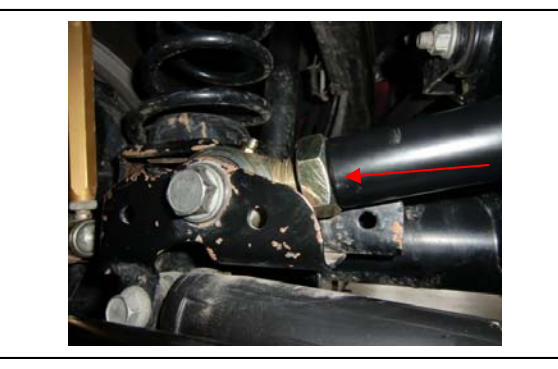
Once the desired length is reached you must tighten and set the jam nut on the adjustable end of track bar.