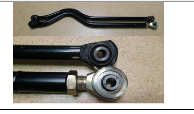
Place track bar side by side to pre set the length. The length will very depending on your application.