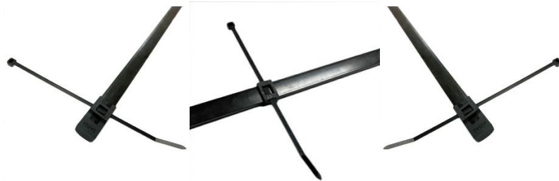
( Lattice endcaps shown) Left / Center / Right.