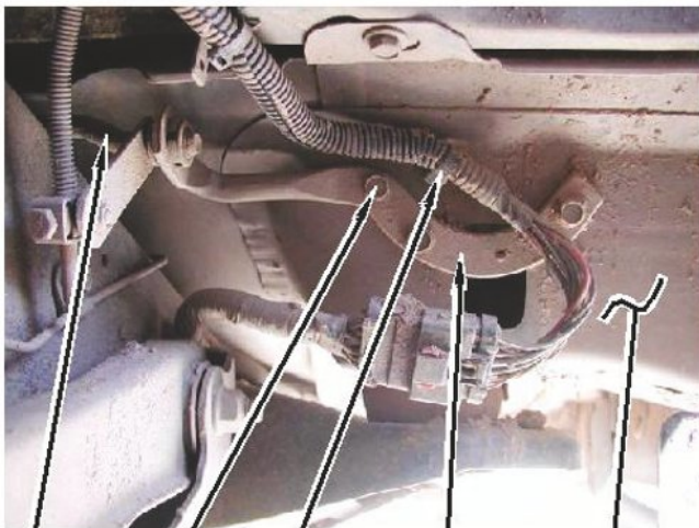
Pivot Shaft Bolt Wire Harness Clip Pivot Shaft Support Arm Cab Floor

Transfer case (1994-97) Remove the cap from the knob on top of the transfer case (4WD) shift lever. Loosen the nut that secures the knob to the shift lever. Remove the screws that secure the shift boot to the floor. Remove the shift boot. Remove the nut that secures the transfer case shift linkage rod to the transfer case. Remove two