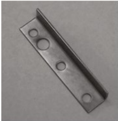
Parking brake bracket