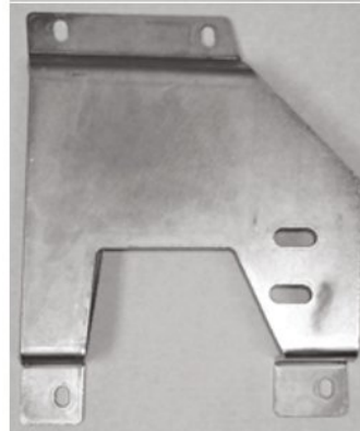
Front bumper bracket