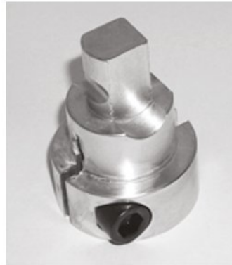
3x2 overload blocks