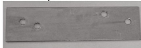
Rear bumper bracket