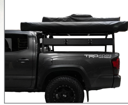
Built in 1000G PVC travel bag with heavy duty large zippers

Large heavy duty velcro straps for storage while not in use