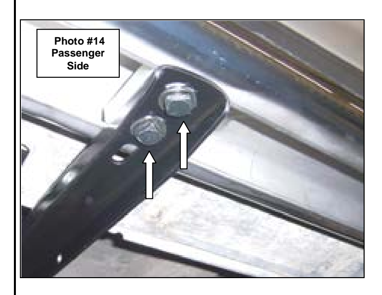
Step12 Re-align the side bar with the vehicle and tighten all side bar and bracket nuts and bolts.