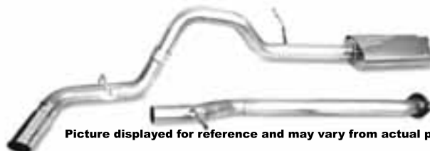
Picture displayed for reference and may vary from actual product