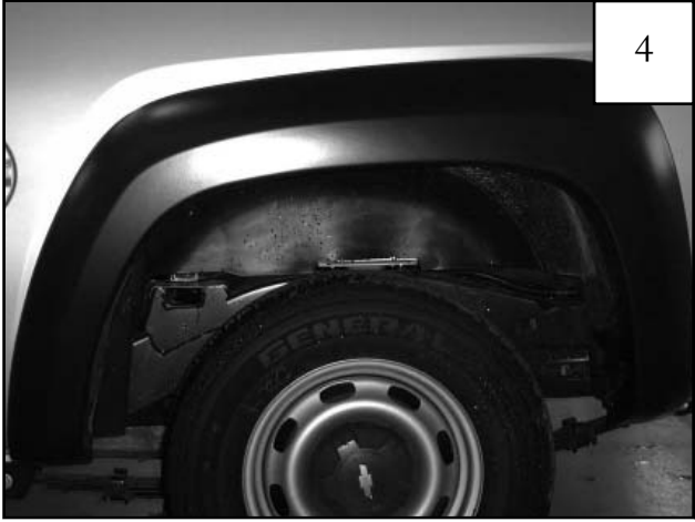
Continue until all six supplied plastic retainers have been inserted through the holes in the flare and into the holes in the fender.