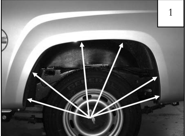
There are six factory holes located at intervals along the edge of the wheel well that will be used to attach the flare.