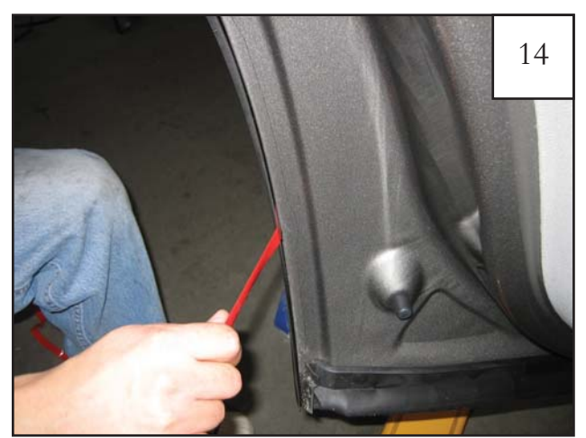
Open the door and gently pull the bottom tape tab you created.