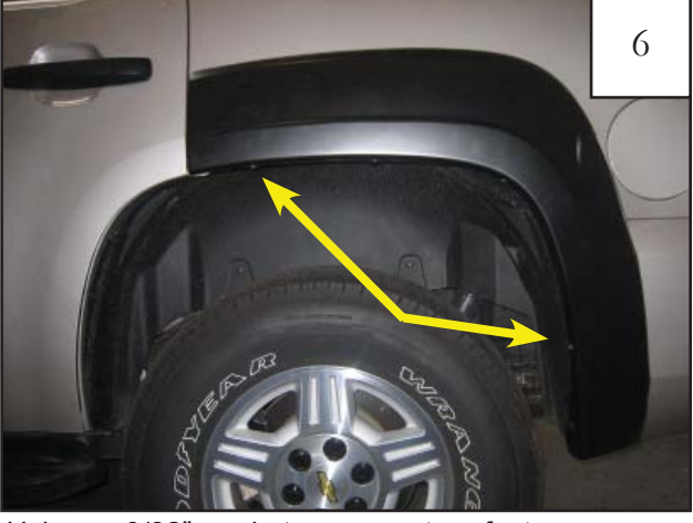
Using a 9/32" socket, remove two factory screws. Retain screws for later use.