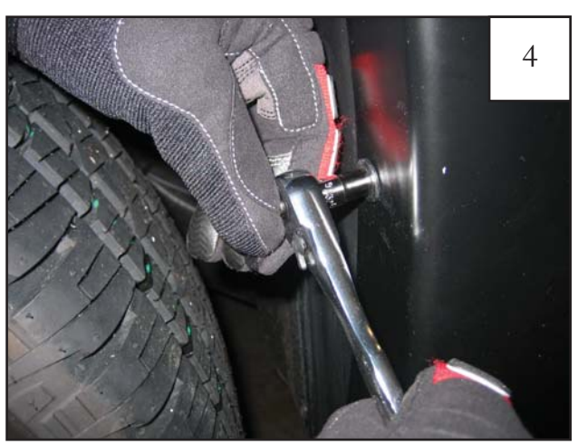
Reinstall factory screws removed in Step 2.