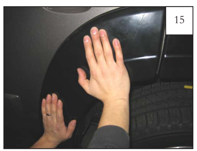
Apply firm pressure to taped areas for proper bond. Tape reaches maximum adhesive bond after 24 hours of contact. Do not wash vehicle until 24 hours have passed.