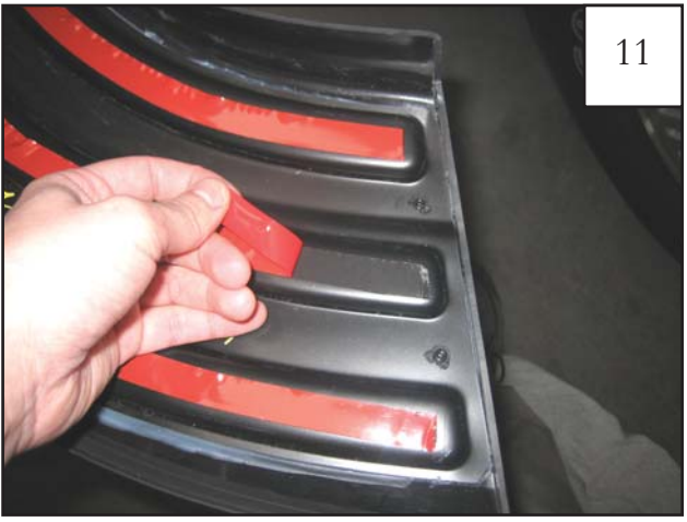
Peel the red liner entirely from the CENTER tape pad. Peel 2" of liner from each of the other two tape pads, folding out to form tabs.