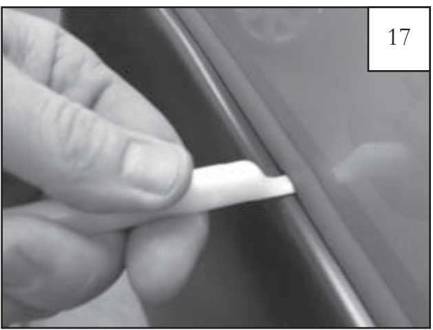
Using flat end of supplied Edge Trim Tool (ET1-0002), seat edge trim against flare by inserting straight end between edge trim and flare at one end. Next, slide around entire edge to the other end.