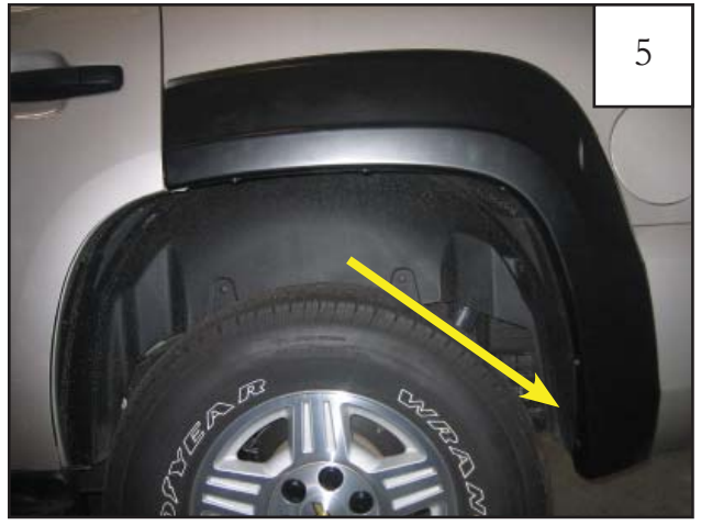
Using a flat head screw driver, remove one factory plastic retainer and discard.