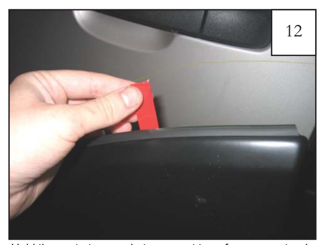
Hold the part at an angle to prevent tape from prematurely sticking, and align part on the door. Make sure liner is protruding from part for ease of removal.