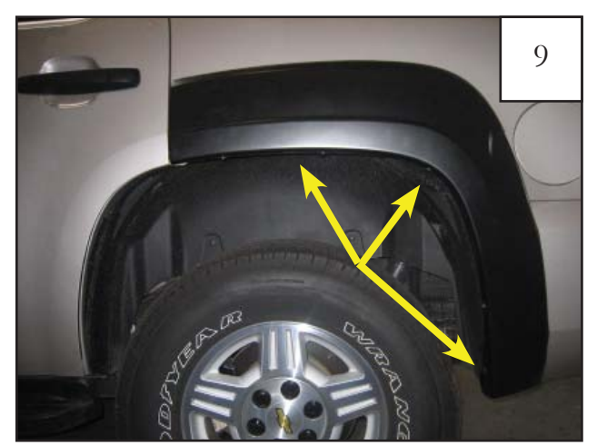
Plastic Push Retainer Locations