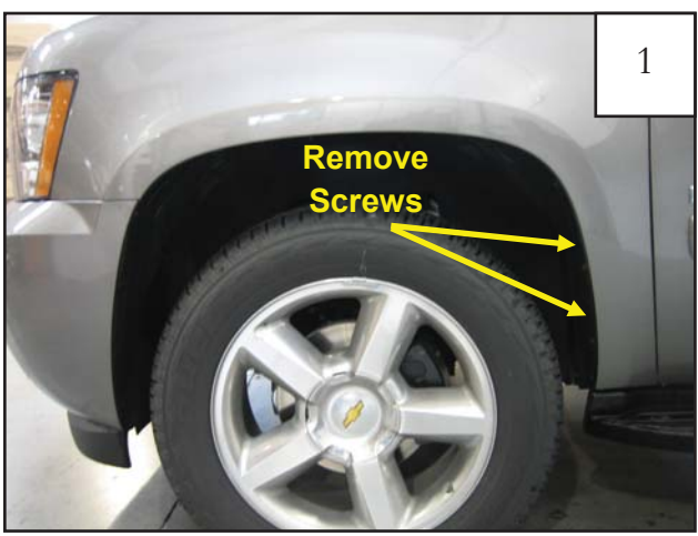
Using a 9/32" socket, remove two factory screws. Retain screws for later use.