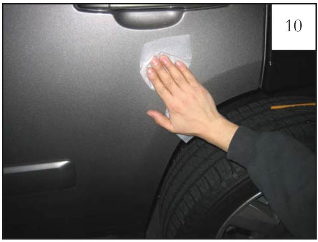
Using a supplied alcohol wipe, clean the area where the door piece will be installed. Make sure area is dry before starting installation.