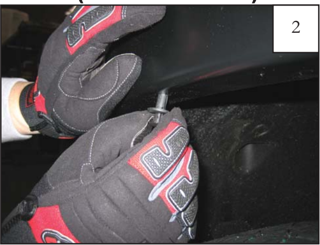
Holding flare in position on fender, install two supplied Plastic Push Retainers.