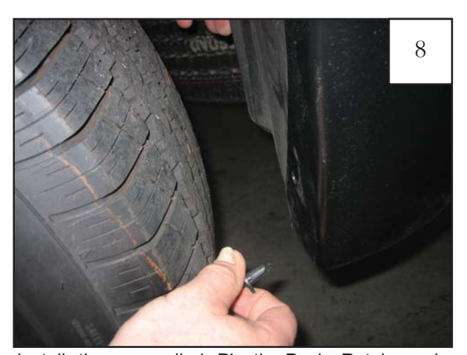
Install three supplied Plastic Push Retainers in remaining holes in flare.