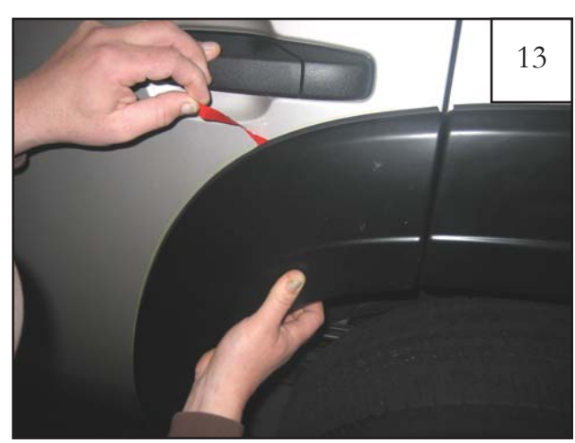
Confirm placement of the part. Gently pull the tape liner from the tape, starting with the top tab you created.