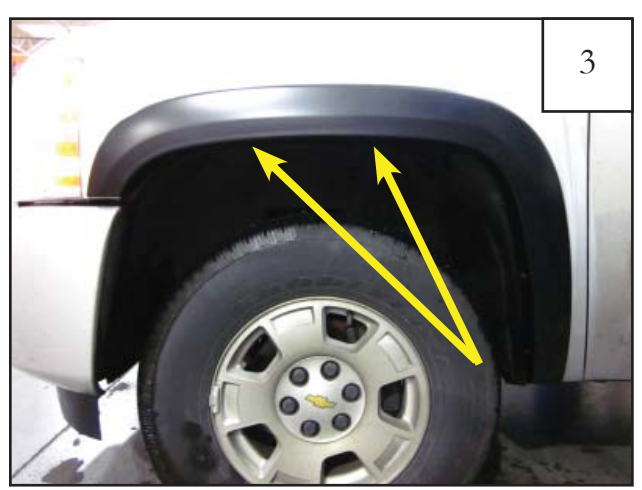
Plastic Push Retainer locations.