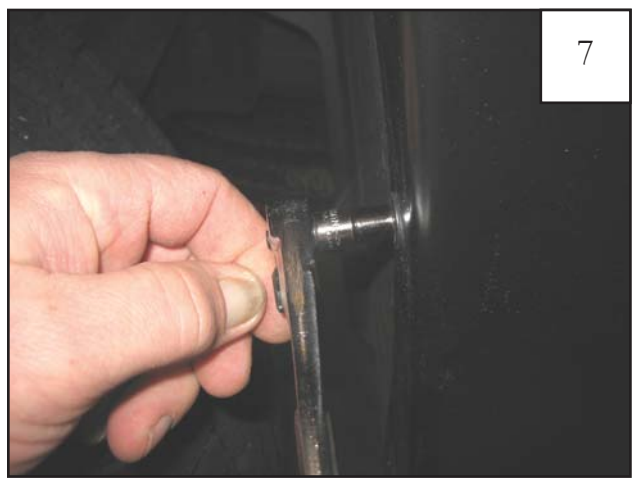
Holding flare in position on fender, reinstall factory screws removed in Step 7.