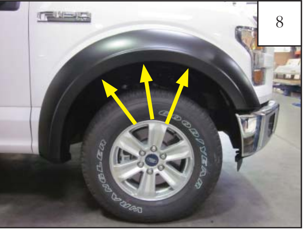
Position flare on fender, pressing inward on the flare, line up the flare mounting holes with the mounting clips on the inner piece. Install 3 Phillips Truss Screws (SW1-0058) through the flare and into the clips on the inner piece. Do not tighten. (3 locations)