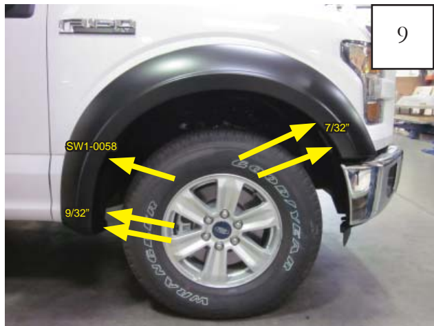
Still holding flare to fender, re-install remaining factory screws removed in Step 1 using 7/32" and 9/32" sockets and wrench. Install supplied screw (SW1-0058) into Clip (CL1-0009). Tighten all screws.