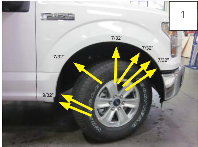
Remove five factory screws with a 7/32" socket wrench. Remove two rear most factory screws with 9/32" socket wrench. Save screws for reinstallation .