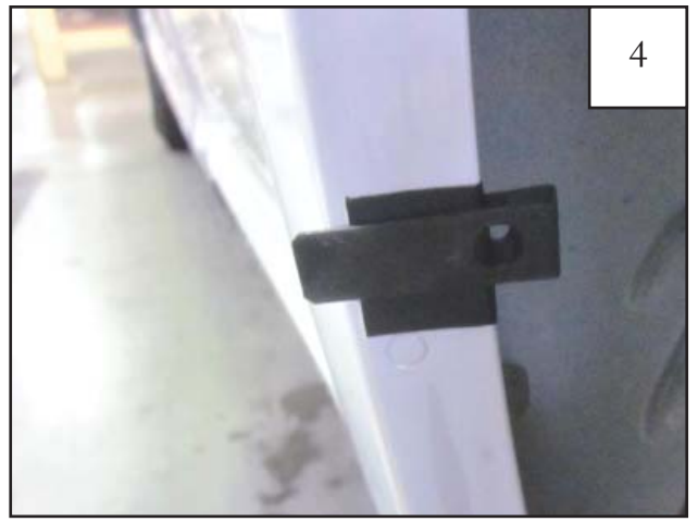
Install a Clip (CL1-0009) over the Tab (MT1-0034) placed in Step 3.