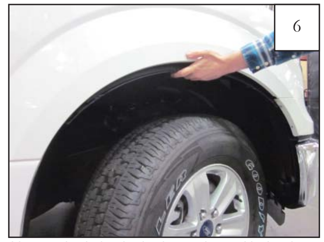
Line up the holes in the inner piece with the three uppermost factory holes. NOTE: Driver's side inner piece is marked with an "LR" and passenger's side inner piece is marked with an "RR".