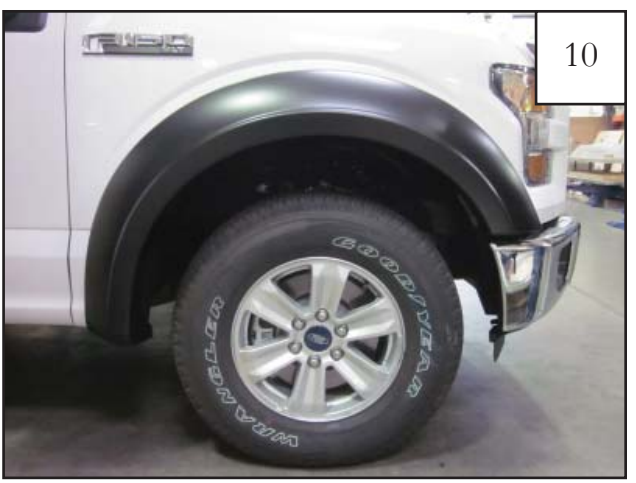
Completed front flare installation.