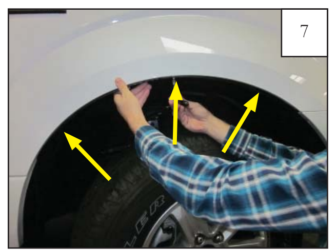
Using a 7/32" socket wrench, reinstall the factory screws through the inner piece.