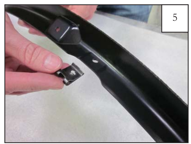
Attach 3 "U"clips (CL1-0022) to the inner bracket as shown.