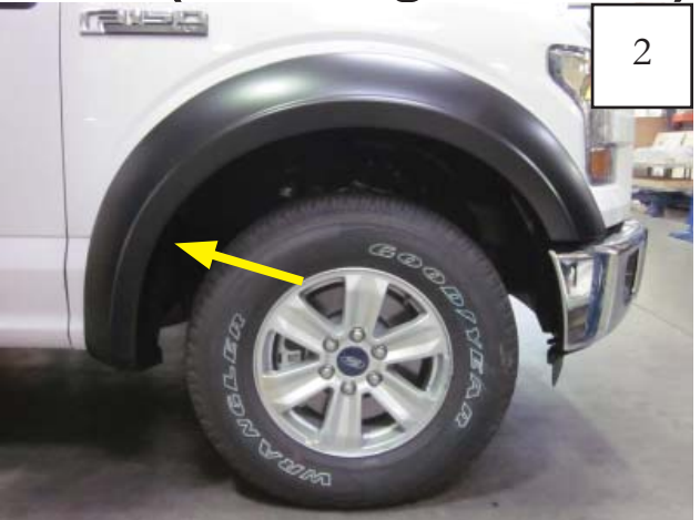
Hold flare to vehicle and mark one flare hole location with a grease pencil.