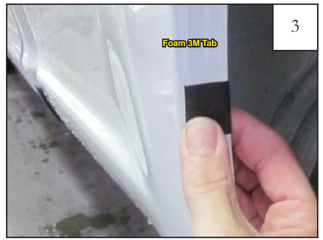
Wrap a Foam Tab (MT1-0034) around the wheel well sheet metal, centered over the mark made in Step 2.