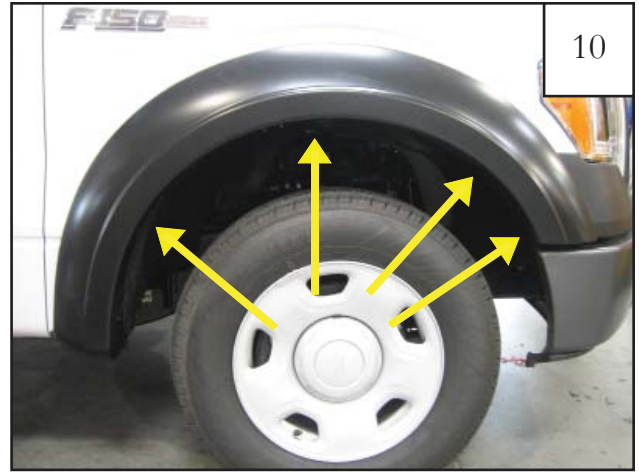
Black plastic retainer locations.