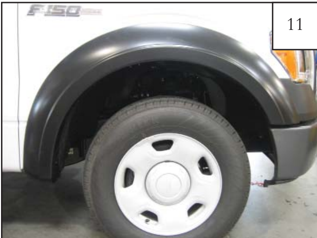
Completed front flare installation.