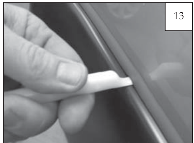
Using flat end of supplied Edge Trim Tool, seat edge trim against flare by inserting straight end between edge trim and flare at one end. Next, slide around entire edge to the other end.