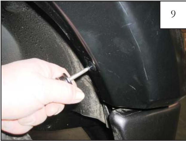
Still holding flare to fender, install supplied black plastic retainers (RV1-P001) using a Phillips screw driver. See step 10.