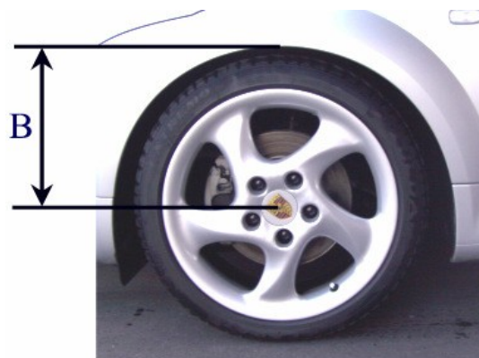
Measurement B Wheel hub center wheel arch

Please enter the adjusted height of the modified car into the list: