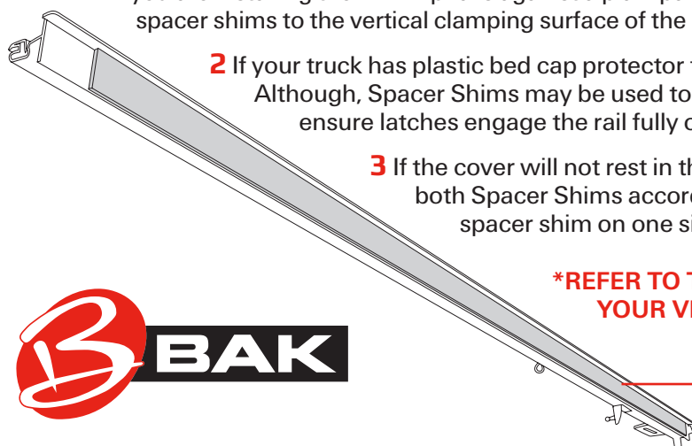
FIG 4: SPACER SHIM

*REFER TO THE GUIDE ON THE BACK PAGE TO DETERMINE IF YOUR VEHICLE NEEDS SPACER SHIMS.