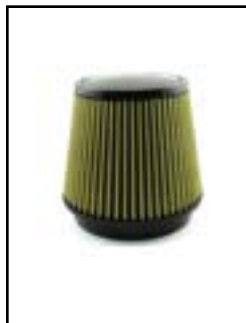
Pro GUARD 7 Air Filter