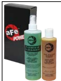
Gold Squeeze Restore Kit