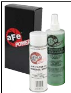
Gold Aerosol Restore Kit