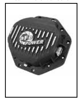
P/N: 46-70272 (Blk/Machined) 46-70270 (RAW)