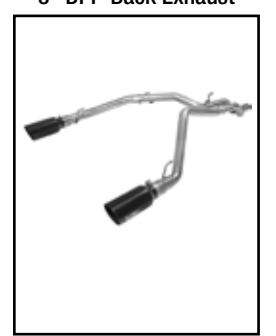
P/N: 49-42044-B (Blk Tips) 49-42044-P (Pol Tips)