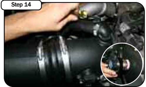
Step 14 Tighten all clamps using 5/16" nut driver. Make sure clamp is over coupler from steps 9-10. Remove grommet from OE air box and install into cover. Install filter minder.