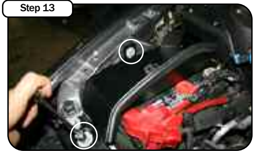
Step 13 Loosen the 2 bolts near passenger side battery for scoop install using 13mm socket or wrench. Attach trim seal to scoop and align to cut-out on housing. Re-install bolts and tighten. Note: Make sure the positive battery terminal is covered with factory cap.