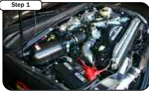
Step 1 Complete stock intake.