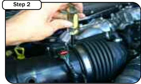
Step 2 Remove filter minder out of air box. Loosen factory clamp with 5/16" nut driver. Disconnect MAF sensor harness.