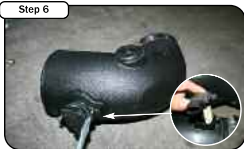
Step 6 Remove MAF sensor from stock air box using t-20 torx bit provided. Install into new tube using gasket and M4 screws and tighten using flat head screwdriver. Install grommet to hole on tube.