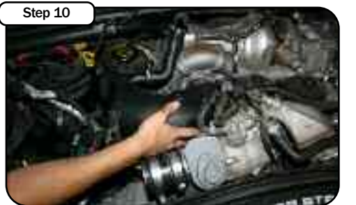
Step 10 Install new tube into vehicle and position coupler inside of tube on turbo. Note: make sure bead on coupler sits on turbo. The clamp on tube will secure the coupler inside of tube. Do not tighten.