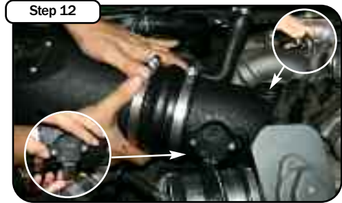
Step 12 Slide coupling onto intake tube and position. Do not tighten. Install crank case fitting into grommet on tube. Reconnect MAF sensor harness.