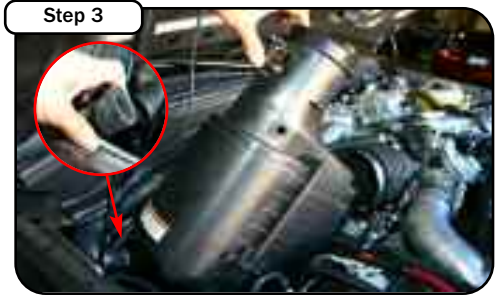
Step 3 Take auxiliary air line out of air box. Lift and pull firmly then remove OE air box out of vehicle.