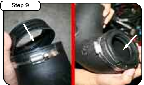
Step 9 Install turbo coupling inside of 05-00957 tube. Make sure radius is inside of tube. Do not tighten.