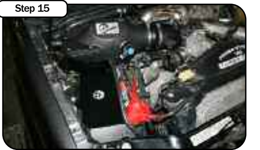
Step 15 Your installation is now complete. Make sure all hoses and clamps are tight. Check and retighten connections and filter after a few hours of operation. Thank You for choosing aFe! NOTE: Place enclosed CARB EO sticker on a clean/smooth surface near the intake system. EO identification label is required to pass the smog test inspection.

Note: This intake system has or may contain pre-production parts. Parts and or prices subject to change.