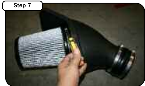
Step 7 Attach air filter to cover using 5/16" nut driver. Attach hump coupler to end of tube with clamps provided. Do not tighten.