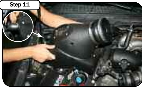
Step 11 Install intake box into vehicle and position to factory. Make sure intake box sits securely in grommets.