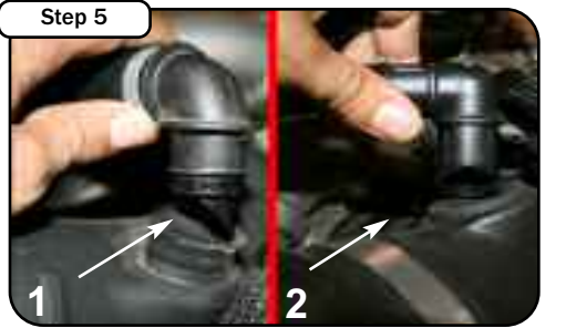
Step 5 1) With cutters or pliers, cut and remove bottom OE clamp. Pull back fitting (Early production tubes which fitting can be re-used.) 2) Later production tubes, cut upper clamp and use plastic fitting & mini clamp provided. Remove tube.