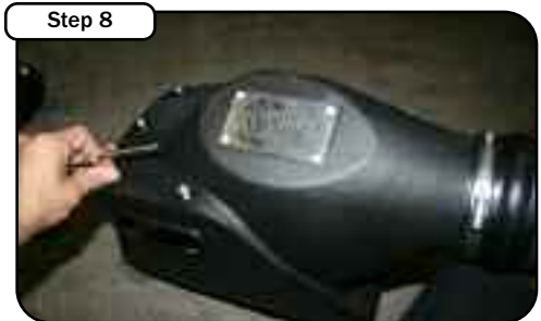
Step 8 Attach cover to bottom half of new air box and secure using the six 5/16" button head screws provided.