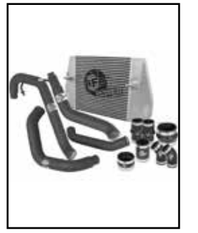
P/N: 46-20122-B ('11-'12)