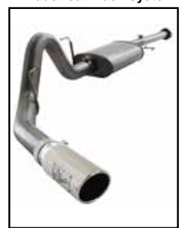
P/N: 49-43067-B (Blk. Tip)

46-20162-B (13-14) 46-43067-P (Pol. Tip) To purchase any of the items above, view airflow charts, dyno graphs, photos, and video; please go to aFepower.com. Page 14