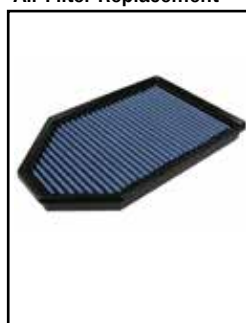
Air Filter Replacement