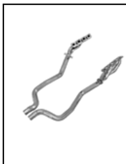
Twisted Steel Header