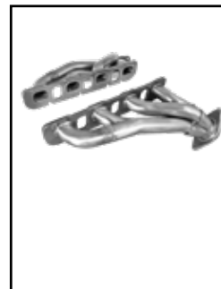
Twisted Steel Header