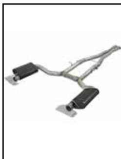
Cat-Back Exhaust System Challenger Only!

P/N: 49-32060 ('15-'16) 49-32061 ('17-'18)