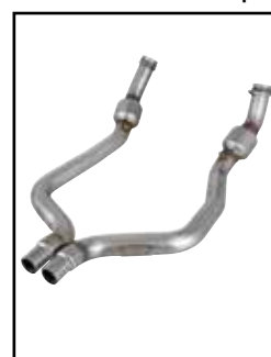
Exhaust Connection Pipes

P/N: 48-32022-RC (Street) 48-32022-RN (Race)