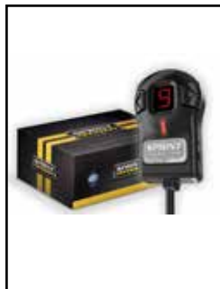
Sprint Booster V3