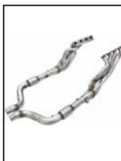
Long Tube Headers + Connection Pipes

P/N: 48-32011-YC (Street) 48-32011-YC (Race)