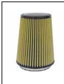
Pro-GUARD 7 Air Filter