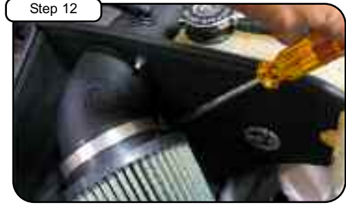
Step 12 Install air filter and tighten using 5/16" nut driver.