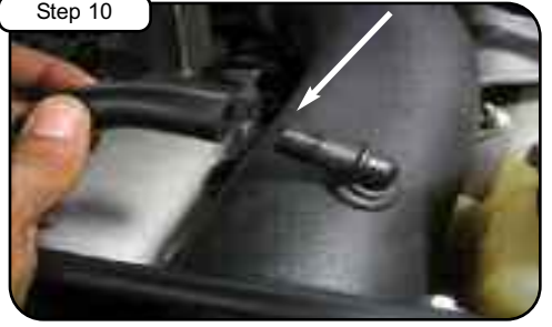
Step 10 Re-connect crank case line to fitting on tube.