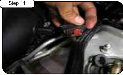
Step 11 Re-connect air temp sensor harness.