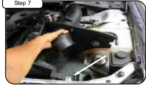
Step 7 Install intake into vehicle. Position housing to tab.