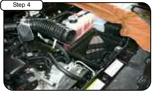
Step 4 Loosen and remove OE intake tube with 5/16" nut driver. Remove bottom air box out of vehicle. Remove air temp sensor.