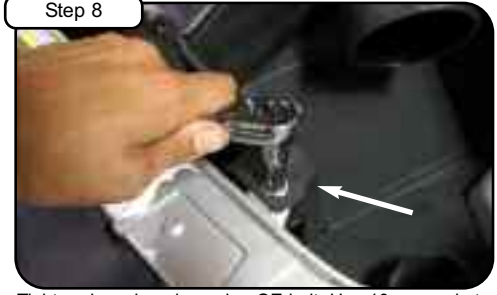
Step 8 Tighten down housing using OE bolt. Use 10mm socket or wrench.