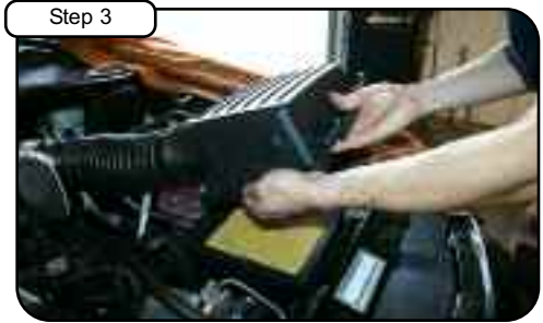
Step 3 Disconnect air temp sensor and crank case line. Lift up and pull OE air box out of vehicle.