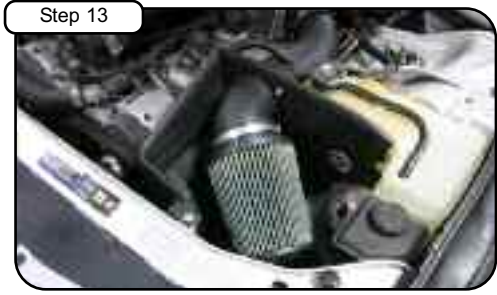
Step 13 Place enclosed CARB EO sticker on a clean/smooth surface on or near the intake system. EO identification label is required in passing the Smog Check Inspection. Your installation is now complete. Please check all bolts and clamps periodically. Re-tighten if necessary. Thank you for choosing aFe!

Note: Filter Cleaning and Re-oiling: When cleaning your aFe filter, be sure to use only aFe's "Restore Kit" (aFe P/N: 90-50001 blue oil aerosol, or aFe P/N: 90-50501 blue squeeze bottle oil) Filter Replacement: Magnum FLOW PN: 24-40011 Pro 5-R™ (black w/blue media) or Pro Dry S™ P/N 21-40011 (black w/white media) Pro Dry S™ cleaning: see cleaning instruction sheet 06-00074