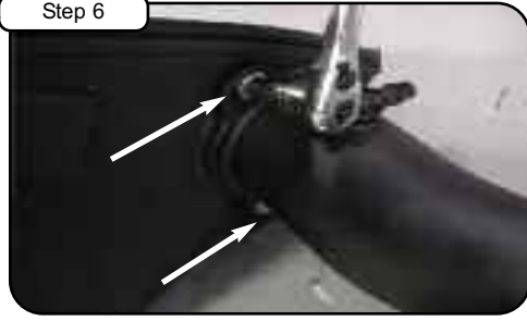
Step 6 Install tube to outside of housing with M6 screws, washers, and nuts provided. Tighten using 10mm socket or wrench. Install trim seal to housing.