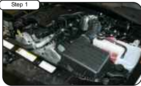
Step 1 Complete Stock Intake.