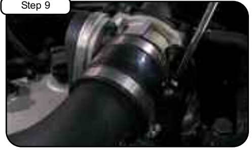
Step 9 Tighten clamps using 5/16" nut driver.