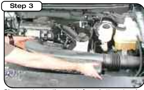
Disconnect negative post from battery terminal. Remove intake air duct by grabbing firmly from both sides and pulling straight back and out.