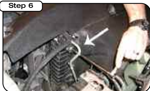
Remove the 8mm bolt on the top left of the fan shroud.