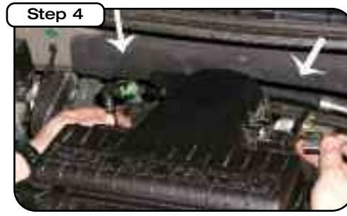
Disconnect the MAF sensor and breather tube on the sides of the airbox. Remove the (4) 10mm screws holding the airbox to the intake manifold and remove intake box.