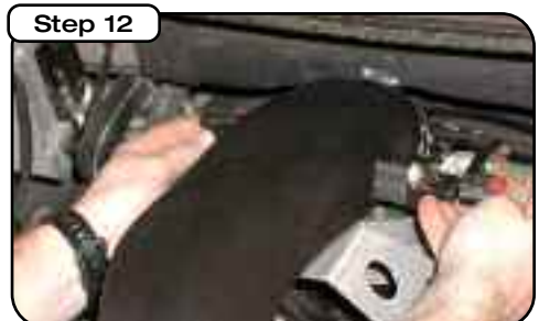
Re-connect the MAF sensor and use provided 1/2" breather hose to connect the intake duct to the crankcase breather on the engine valve cover.