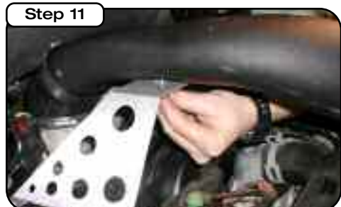
Line up the mounting holes on the intake duct and tighten assembly with the provided screws and washers.