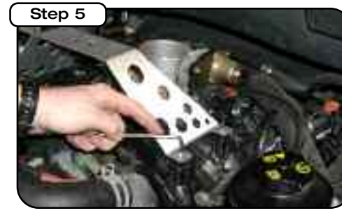
Install the intake tube support bracket to the intake manifold and fasten with the supplied M6 button head screws and washers.