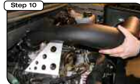
Place coupler (05-00464) on the throttle body (see diagram below for correct coupler position) and the housing. Position intake duct into engine bay and tighten down the clamps.