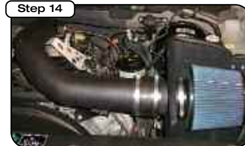
Place enclosed CARB EO sticker on a clean/smooth surface on or near the device. EO identification label is required in passing a smog check inspection. Your installation is now complete.