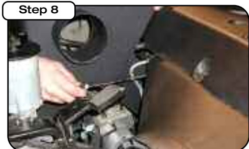
Position the housing into the engine bay. Line up the mounting holes with the rear support bracket and the radiator shroud and tighten all the nuts and bolts using the supplied hardware.