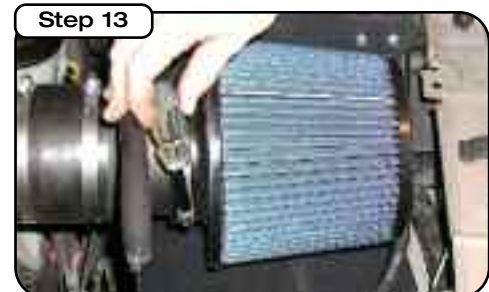
Install the pre-oiled filter in the housing and tighten down clamp. DO-NOT use any oil or grease. Install the housing trim seal on the sides of the panel by starting at one corner and working your way around the edge of the housing.