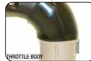
Position coupler and clamps over throttle body (3.5" x 4.0") (clamps removed for clarification). The smaller (3.5") end of the coupler goes over the throttle body. The (4") end of the coupler goes around the intake tube.