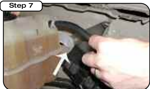
Remove the 8mm bolt on the side of the coolant reservoir. Sandwich the housing support bracket between the coolant reservoir tab and the fenderwell. Reinstall the 8mm bolt.