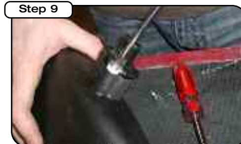
Transfer the MAF sensor from the factory airbox to the new intake tube. Make sure you use the provided nylon spacers and MAS gasket.