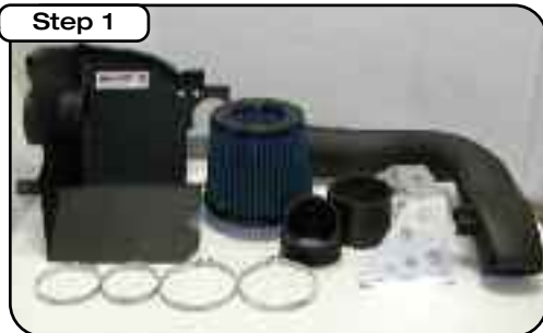
Complete kit with parts.