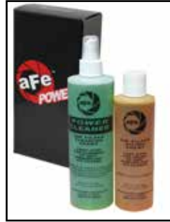
Gold Squeeze Restore Kit