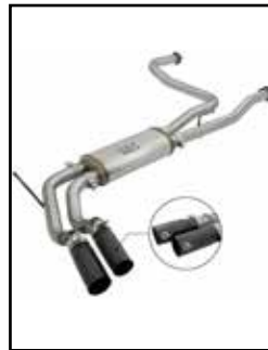
Side-Exit Exhaust System

P/N: 49-46124-B (Blk. Tips) 49-46124-P (Pol. Tips)