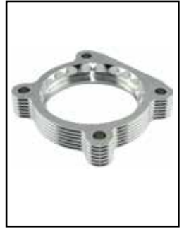
Throttle Body Spacer