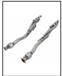
Headers + Connection Pipes

P/N: 48-46107-YC (Street) 48-46107-YN (Race)