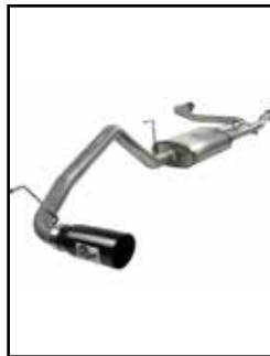
Cat-Back Exhaust System

P/N: 49-46102-B (Blk. Tip) 49-46102-P (Pol. Tip)