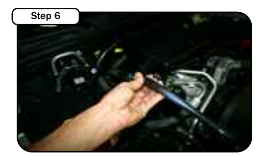
Remove the vent hose from Commander models. Remove hose to tee junction on Grand Cherokee models.