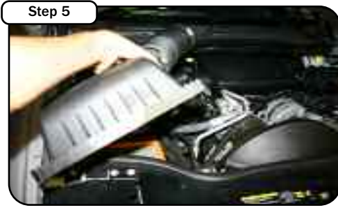
Carefully take out the OE intake and filter away from vehicle. Leave bottom half of OE airbox in vehicle.