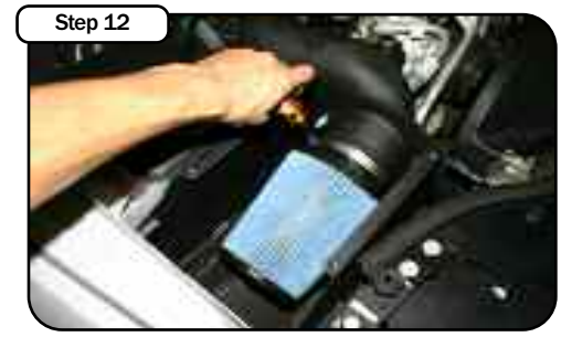
Install filter onto intake tube and tighten using 5/16" nut driver