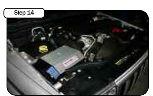
Place enclosed CARB EO sticker on a clean/smooth surface on or near the intake system. EO identification label is required in passing the Smoo Check Inspection. Your installation is now complete. Check all clamps and connections. Periodically check all clamps and hoses. Thank you for choosing afe!