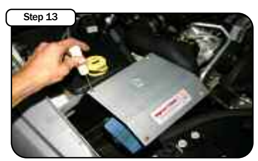
Install housing cover using button head screws provided. Tighten using 5/32" allen key.