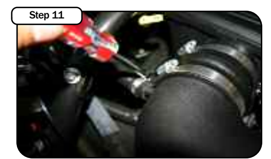
Tighten clamps on intake tube to plenum box with 5/16 nut driver. Place new vent hose onto tube and tighten clamp using 1/4" nut driver. (on Grand Cherokee models the excess vent hose will need to be trimmed to length approx. 4")