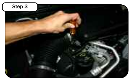
With 5/16" nut driver loosen top of OE intake tube.