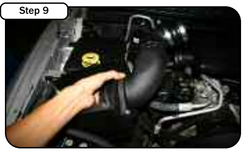
Place the hump coupler onto the tube with clamps provided and install intake into vehicle.