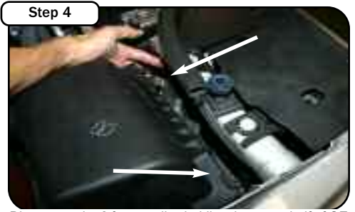
Disconnect the 2 factory clips holding the upper half of OE airbox. Also, disconnect the valve cover vent hose away from airbox.