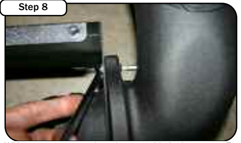
With screws, nuts, and washers provided, place new aFe tube onto housing and tighten using a phillips screwdriver and 7/16" socket or wrench.