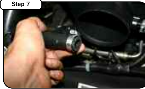
With 5/8" hose provided, install new hose into valve cover vent (on Grand Cherokee models connect hose to vent tee). Place mini clamp onto hose and wait to tighten on new intake tube.