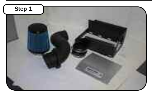
Complete kit components.