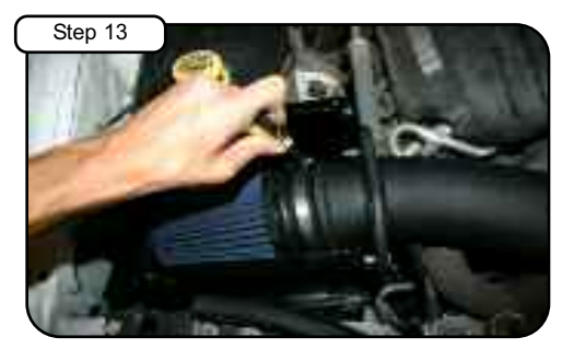
Place high flow aFe filter onto tube. Tighten using 5/16" nut driver. Gently place cover onto housing using the 4 button head screws. Tighten using 5/32" allen wrench.