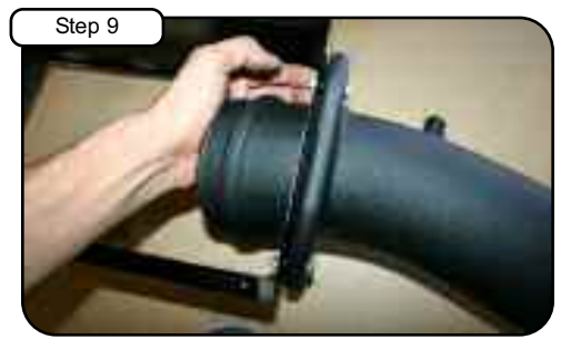
With supplied screws, nuts and washers, mount aFe intake tube onto housing. Tighten using 7/16" socket or wrench.