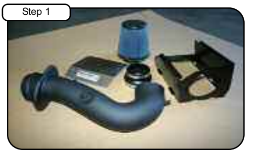
Complete kit with parts.