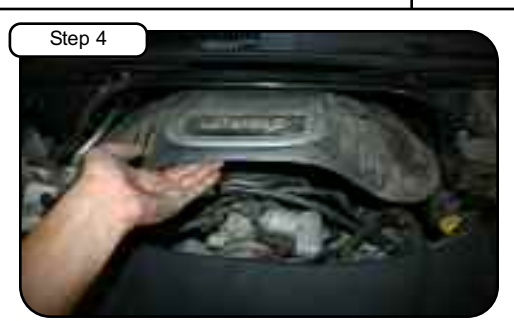
Carefully remove engine cover, remove oil cap first and gently pull up and forward.