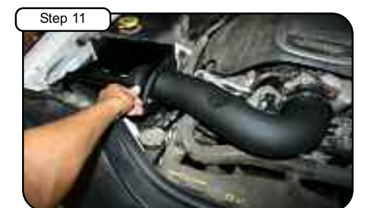
Gently place the new tube and housing into vehicle. At housing, re-attach the two OE clips from bottom half of airbox to the new aFe housing. Tighten clamp on coupler at the tube side.