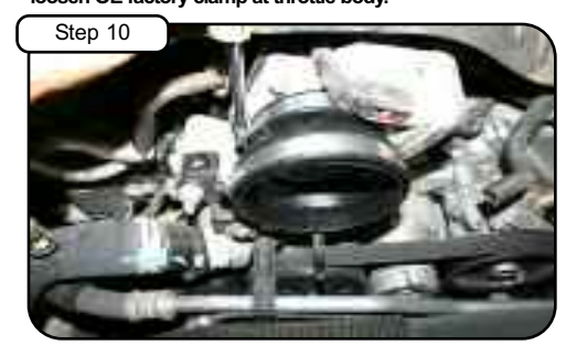
Place the reducer coupler onto the throttle body with supplied clamps. Tighten down the clamp at throttle body only.