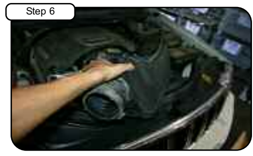
Carefully remove upper half of OE airbox and plenum intake box.