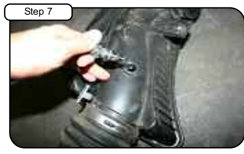
Remove the factory air temp sensor from bottom of the OE intake plenum box. Set aside to be re-installed on to new aFe intake tube.