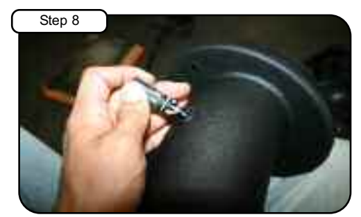
Install supplied grommet into tube. Carefully place air temp sensor into new aFe intake tube.