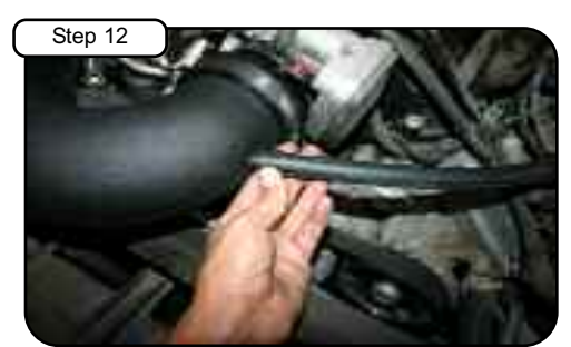
Carefully remove OE breather line. Replace with 1/2" hose supplied, insert one end onto tube and other onto breather fitting. Use the supplied mini clamps.