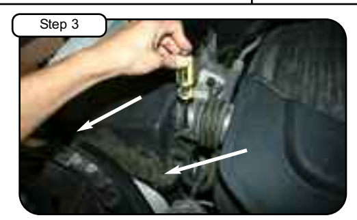
With 5/16" nut driver, loosen clamp at OE airbox. Detach the two factory clips holding the top of the OE airbox.