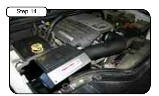
Place enclosed CARB EO sticker on a clean/smooth surface on or near the device. EO identification label is required in passing the Smog Check Inspection. The installation is now complete. Periodically Check all clamps and connections. Thank you for choosing aFe!