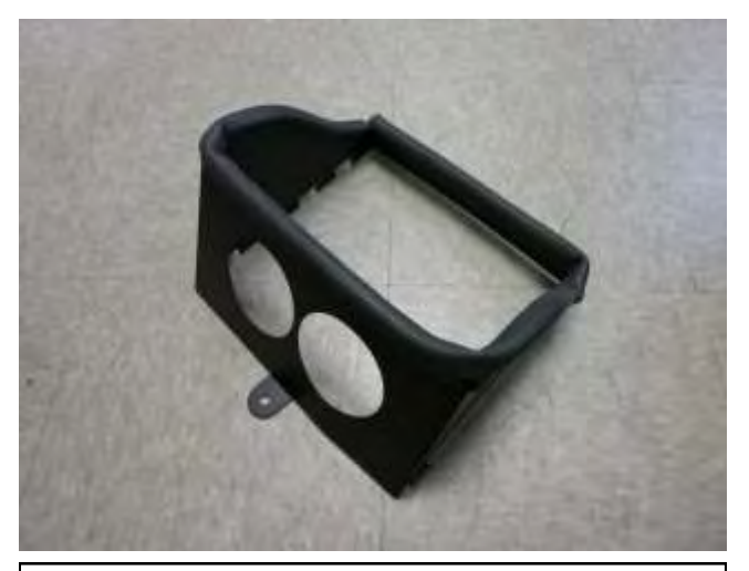
c. Install the provided edge trim onto the heat shield as shown. Note: Trimming the edge trim maybe necessary.