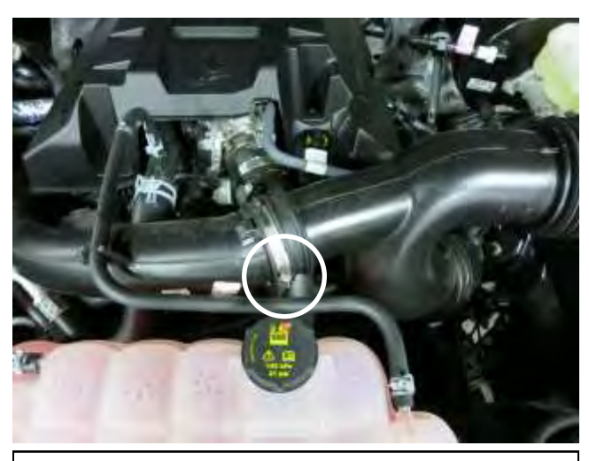
c. Loosen the hose clamp at the upper air intake tube.