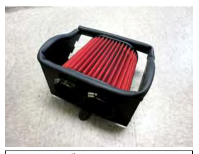
d. Install the \mathsf{AEM}^{\text{(8)}} filter into the heat shield with the provided hose clamps.