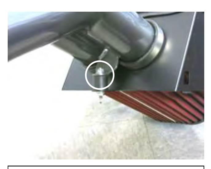
g. Install the provided nut and washer onto the AEM® intake tube bracket, then tighten both sides.