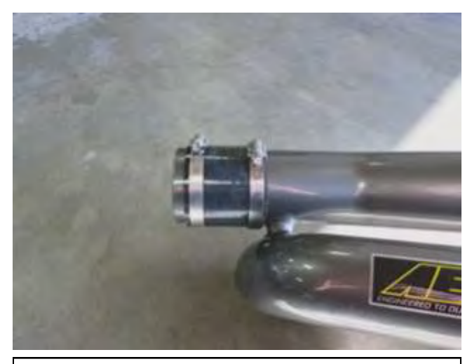
i. Install the straight coupler with hose clamps onto the AEM<sup>®</sup> tube. Note: Use soap and water to allow the coupler to slide on the intake tube.