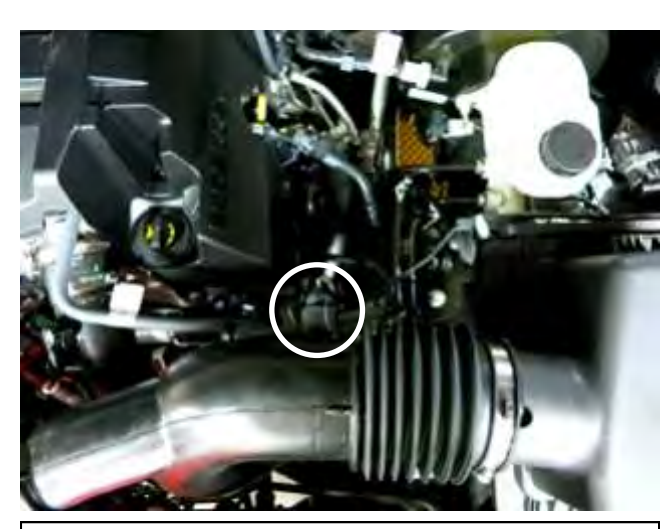
b. Disconnect the intake air temperature sensor connector.