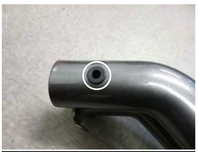
a. Install the provided grommet into the AEM® intake tube.

a. When installing the intake system, do not completely tighten the hose clamps or mounting hardware until instructed to do so.