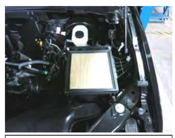
f. Remove your stock air filter from the lower air box.