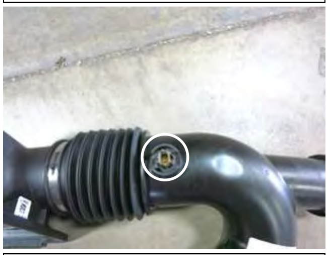
g. Remove the air intake temperature sensor from the stock intake tube. Note: This will be reused in step 3b.