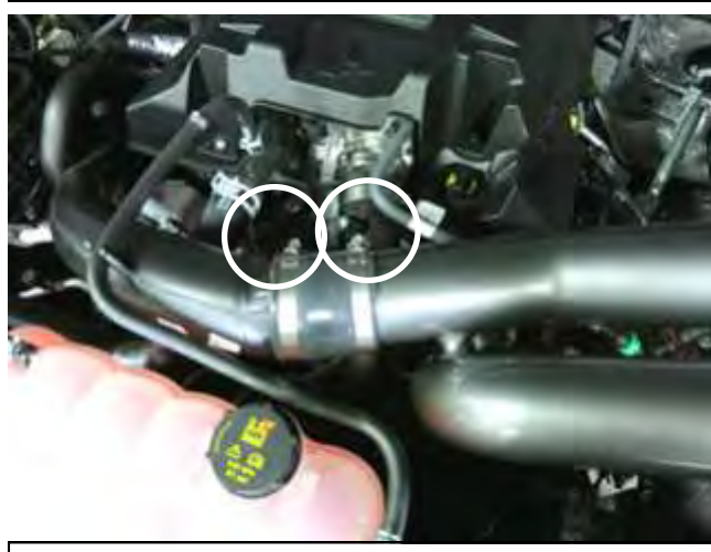
I. Install the straight coupler with hose clamps onto the stock upper intake tube. Tighten both hose clamps at this time.