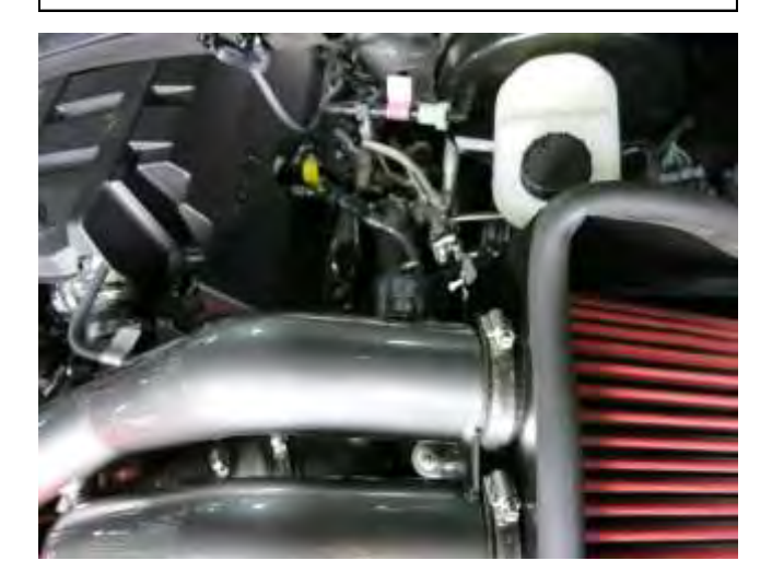
m. Connect the air temperature sensor connecter onto the air temperature sensor that was removed in step 2b.