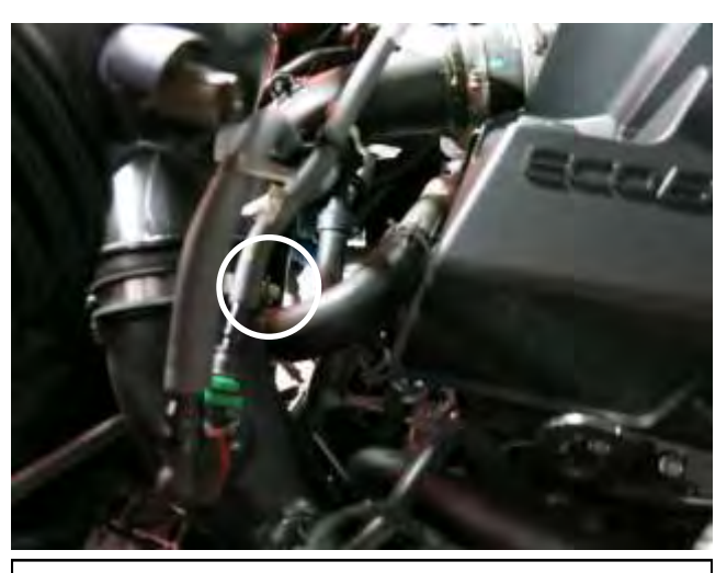
d. Loosen the hose clamp at the lower air intake tube.