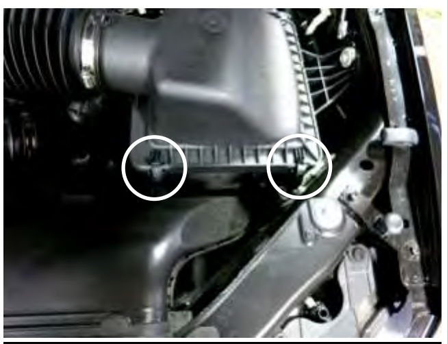
a. Detach the two latches securing the upper air box lid to the lower air box lid.