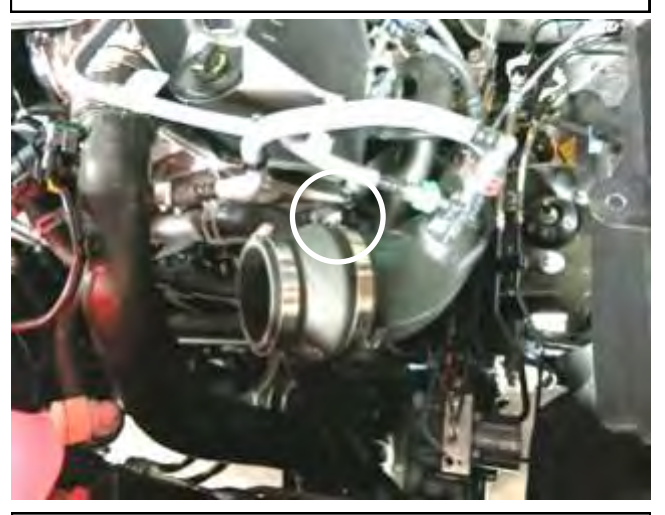
h. Install the step coupler with the provided hose clamps onto the lower intake tube as shown. Tighten hose clamp circled.