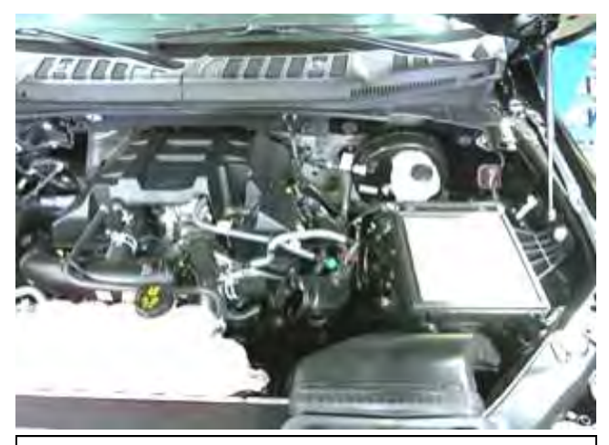
e. Remove the stock air intake system from the vehicle. Note: Do not discard any of your stock equipment.