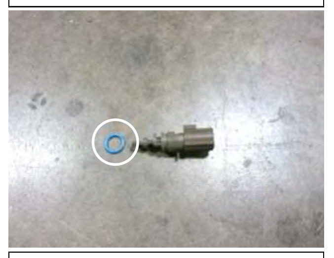
h. Remove the O-ring from air temperature sensor. Note: The O-ring will not be reused.