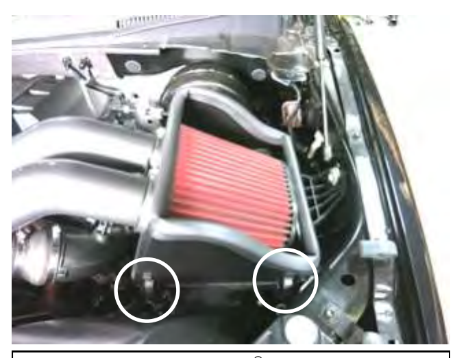
j. Install the assembled AEM<sup>®</sup> intake tube and heat shield into the vehicle. Align the heat shield into the lower air box and latch the clips to secure it in place.