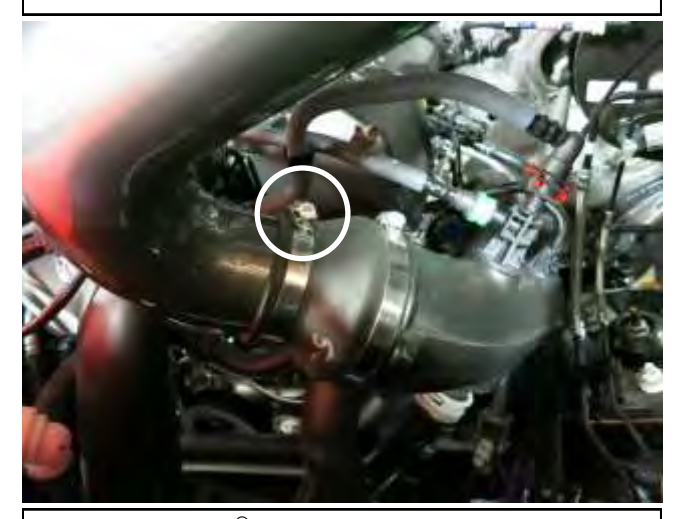
k. Align the AEM<sup>®</sup> intake tube with the step coupler that was previously installed in step 3h. Tighten the hose clamp circled at this time.