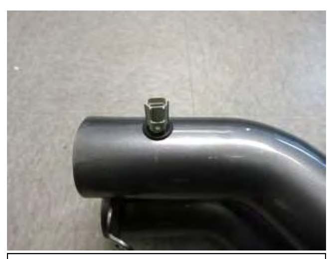
b. Install the air temperature sensor that was removed in step 2g into the AEM® intake tube.