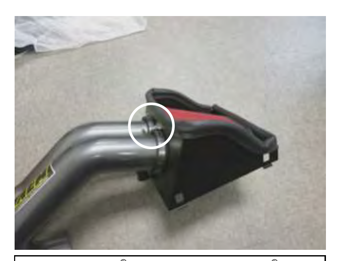
f. Install the AEM® intake tube into the AEM® air filter while aligning the rubber mount with the bracket on the intake tube. Tighten the hose clamps on the filter.