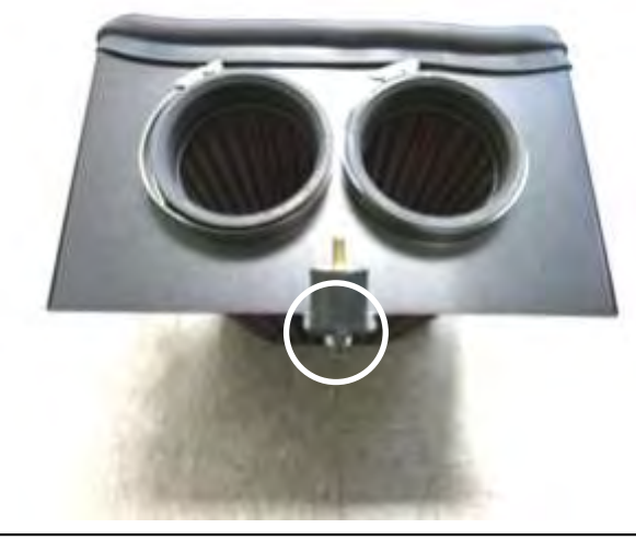
e. With the provided hardware, install the rubber mount/washer/nut onto the heat shield tab.