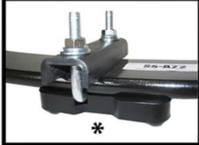
PSP-19 with hold-down clamp assembly