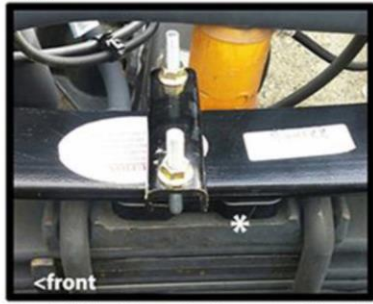
Install the SuperSprings as pictured below, then thread the channel crossplate on to the ubolt. Tighten securely.