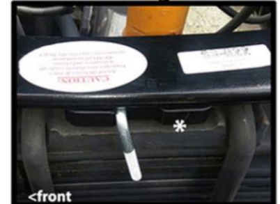
Place PSP-19 on top of spring plate flat side up facing, with groove toward the front