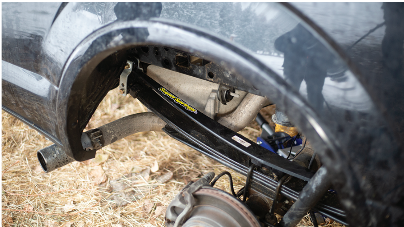
SSA28 installed on a 2018 Ford F150 4x4