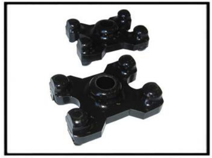
Polyurethane Mounting Base