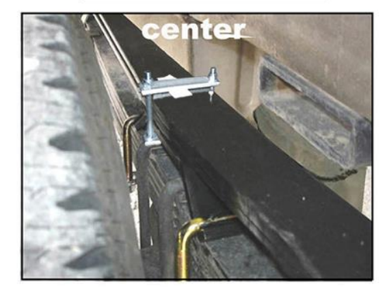
SuperSprings Mounting Kit # MXKT Installed