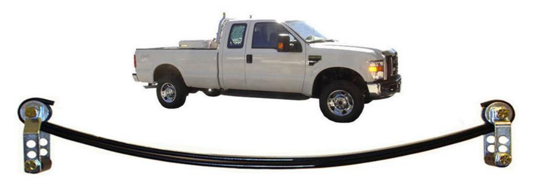
Poly Spring Pad PSP-7

Ford F-250 F-350 Super Duty [2008 ~ 2010] without factory top overload SuperSprings Part# SSA10 ~ SSA15 with PSP-7