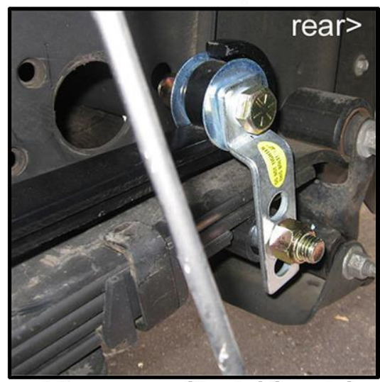
front & rear ~ adjustable preload

Refer to SuperSprings application guide for part selection www.supersprings.com [Tech line #866-898-0720] SuperSprings enhance load carrying capability, handling & towing. Never exceed vehicle manufacturer's GVWR rating.