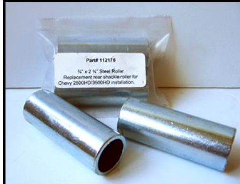
Replacement rear shackle roller for GM 2500/3500 HD installation (inside SSA15 box)