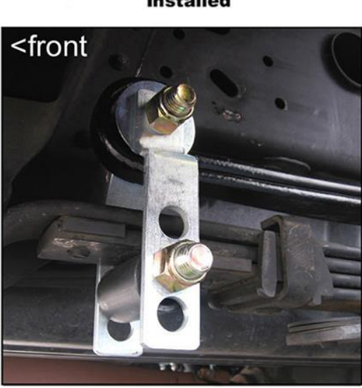
front ~ spring eye bolt threads out