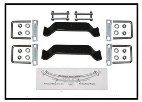
SuperSprings Mounting Kit # MTKT Installed ———