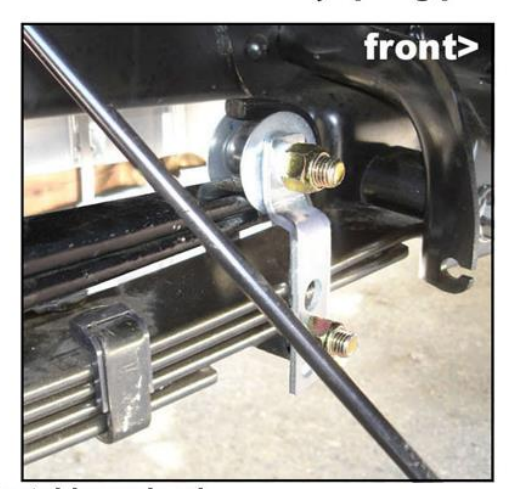
front & rear ~ adjustable preload

Refer to SuperSprings application guide for part selection www.supersprings.com [Tech line #866-898-0720] SuperSprings enhance load carrying capability, handling & towing. Never exceed vehicle manufacturer's GVWR rating.