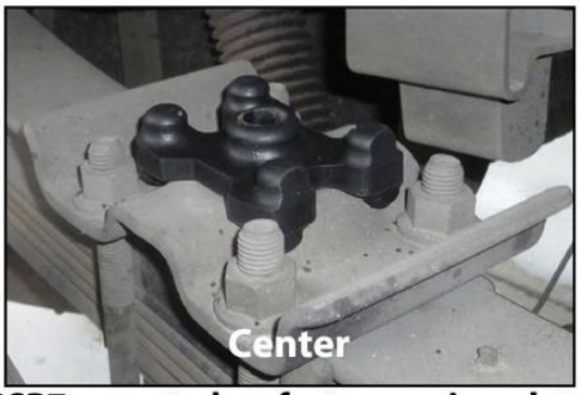
PSP7 mounted on factory spring plate