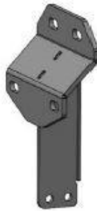
PASSENGER SIDE FRONT-CENTER-REAR BRACKET-1 3 x QTY