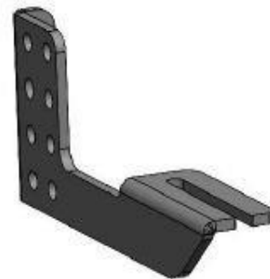
DRIVER SIDE FRONT-CENTER-REAR BRACKET-2 3 x QTY