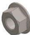
M8 FLANGE NUT 18x