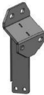
DRIVER SIDE FRONT-CENTER-REAR BRACKET-1 3 x QTY