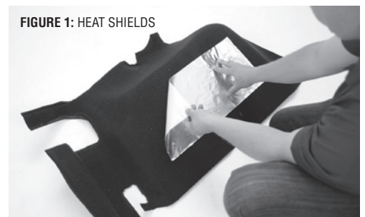
FIGURE 1: HEAT SHIELDS