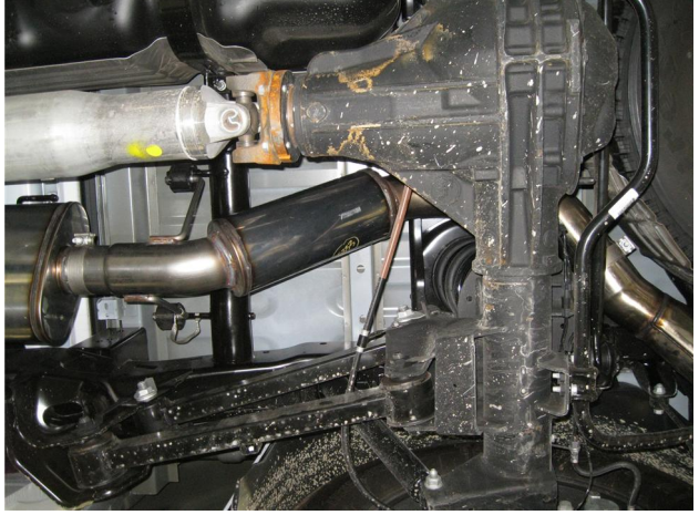
Step 2. Begin by attaching the Muffler Assembly to the factory outlet and the Resonator Assembly to the Muffler Assembly outlet using the supplied 3.50" clamps. Fit the hangers into the rubber insualtors. Leave all clamps loose until final adjustment.