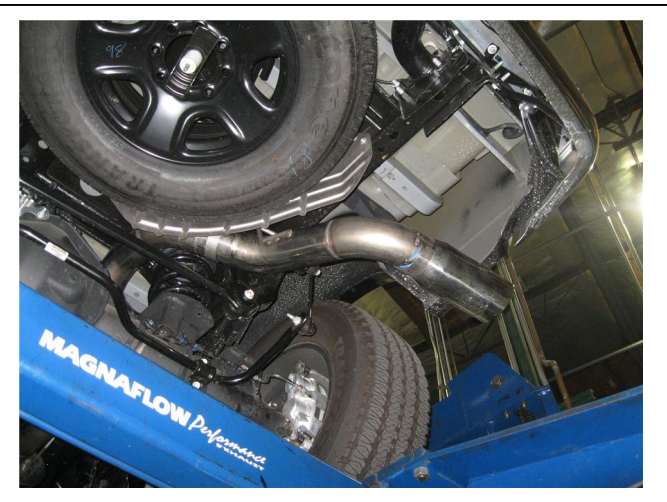
Step 3. Next Install the Tail Pipe Assembly using the supplied 4.00" clamp and fit the welded hanger into the rubber insulator.