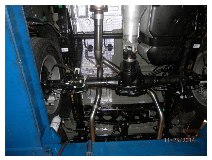
Step 5. Continue the installation by loosely attaching the Over Axle Assemblies to the Muffler using a supplied 2.50" clamp and inserting the hanger into the rubber insulator.