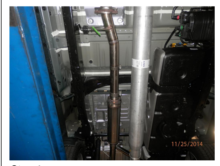
Step 4. If your vehicle has a Crew Cab/Standard Bed configuration you will need to include the supplied 14.50" Extension Pipe between the Inlet Pipe Assembly and the Muffler. For Crew Cab/Short Bed and Extended Cab/Standard Bed the Extension Pipe is omitted. Next loosely attach the Muffler to the Inlet Pipe Assembly using the supplied 3.00 clamps.