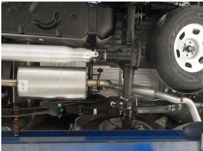
Step 1. To remove the OEM system you will need to unfasten the two bolt flange located behind the flex pipe. Working rearward (with the exhaust supported) extract the hangers from the rubber insulators and remove the OEM exhaust. Do not discard or damage the rubber insulators or fasteners as they will be used to install the new exhaust system.