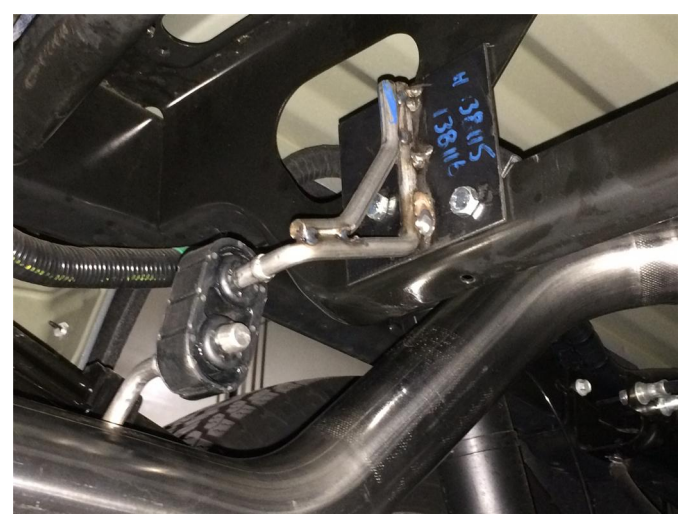
Step 6. Loosely install the Tail Pipe Assemblies in a similar fashion using the supplied 2.50" clamps. Attach the supplied hanger bracket as shown using the supplied hardware. The mounting holes in the bracket will align with pre-existing holes in the vehicles sub frame. Attach the Hanger Bracket to the welded hanger on the drivers side Tail Pipe Assembly using the supplied Hanger Rubber.