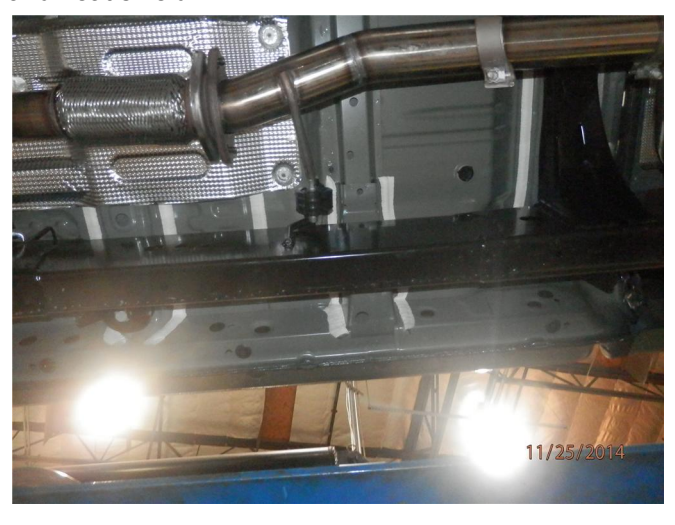
Step 3. Begin installing of the new system by attaching the Inlet Pipe Assembly to the flange re-using the OEM fasteners and inserting the hanger into the rubber insulator.