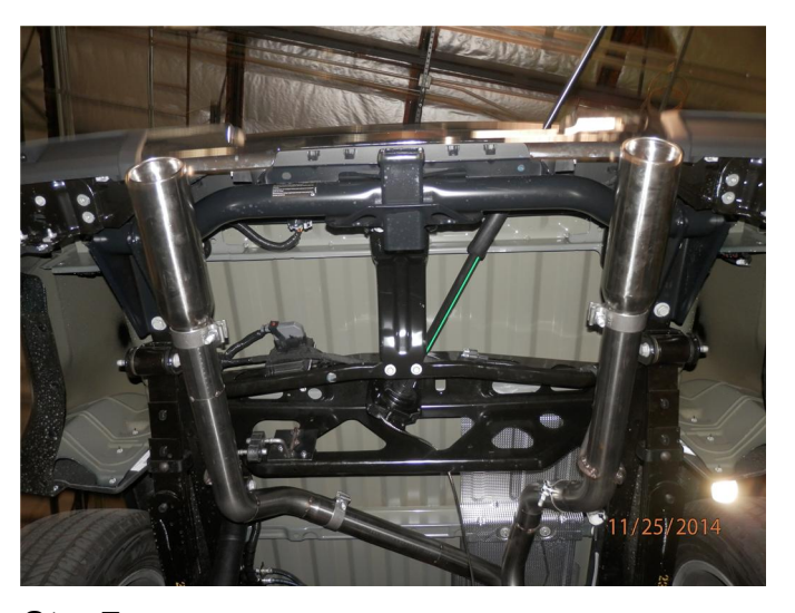
Step7. Install the two Clamp-On Tips using the supplied 2.50" clamps.