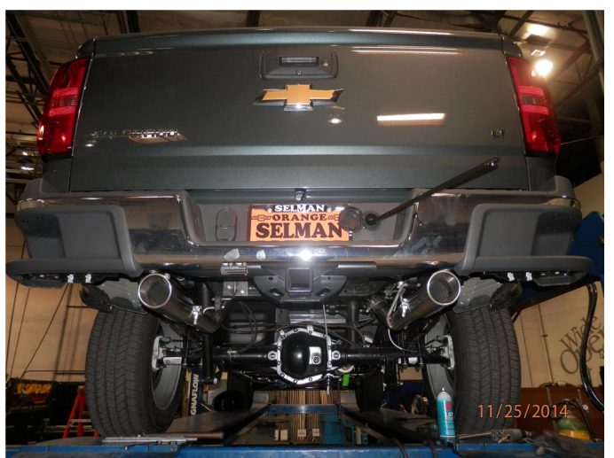
Step 8. Once a final position has been chosen for the new exhaust system, evenly tighten all clamps from front to rear using the torque specifications on page one of the instructions. Inspect all fasteners after 25-50 miles of operation and re-tighten if necessary.