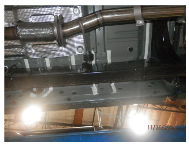
Step 2. Begin installing of the new system by attaching the Inlet Pipe Assembly to the flange re-using the OEM fasteners and inserting the hanger into the rubber insulator.