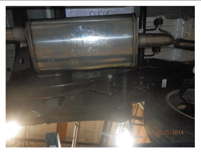
Step 3. If your vehicle has a Crew Cab with a Standard Bed configuration you will need to include the supplied 14.50" Extension Pipe between the Inlet Pipe Assembly and the Muffler. For Crew Cab/Short Bed and Extended Cab/Standard Bed the Extension Pipe is omitted. Next loosely attach the Muffler to the Inlet Pipe Assembly or the Extension Pipe using a supplied 3.00" clamps.