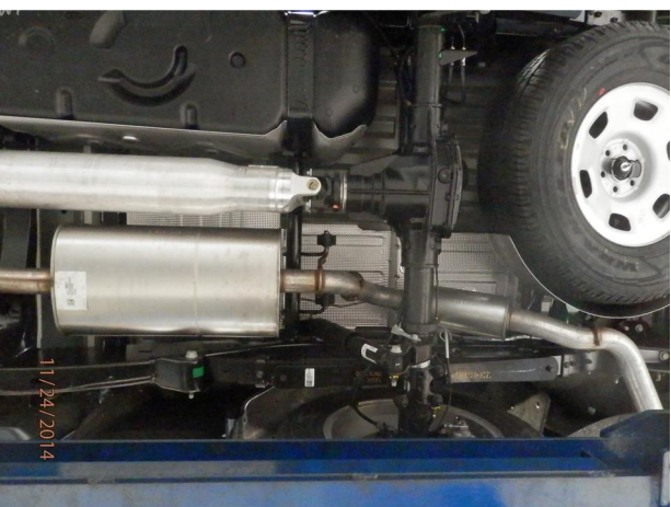
Step 1. To remove the OEM system you will need to unfasten the two bolt flange located behind the flex pipe. Working rearward (with the exhaust supported) extract the hangers from the rubber insulators and remove the OEM exhaust. Do not discard or damage the rubber insulators or fasteners as they will be used to install the new exhaust system.