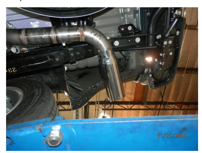
Step 4. Complete the installation by attaching the Tail Pipe Assembly to the Muffler using a supplied 3.00" clamp and inserting the hanger into the rubber insulator.