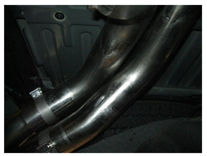
Step 3. Next Install the Tail Pipe Assembly to the Extension Pipes in a similar fashion using the supplied 3.50" clamps and by fitting the welded hangers into the rubber insulators.