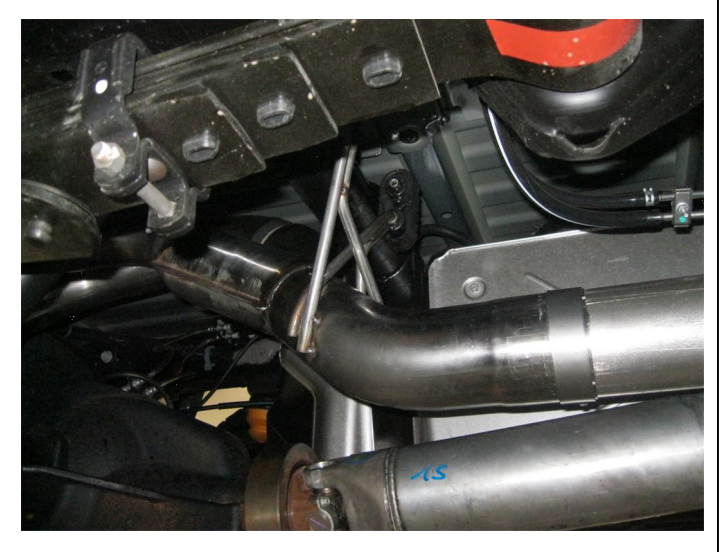
Step 2. Begin installation of the Magnaflow system by first clamping the Y-Pipe Assembly inlet to the newly cut outlet of the DPF using the supplied 4.00" clamp. Then attached the two Extension Pipes to the Y-Pipe Assy using the suplied 3.50" clamps and fitting the hangers in the rubber insulators (leave all clamps loose for final adjustment of the complete system). If your vehicle has an O2 sensor re-install at this time. If not, install the provided sensor boss plug.

Step 1. To begin the removal of the OEM system check to see if it has an o2 sensor connected to the exhaust system, if so remove the sensor and hang it out of the way. Next, you will need to cut the exhaust pipe behind the DPF. If your vehicle has a Crew Cab/Standard Bed you will need to cut 31.50" rearward of the DPF. For Crew Cab/Short Bed cut at 18.25". For Extended Cab/Short Bed cut at 9.50" as shown in the diagram. You can then disengage the welded hangers from the rubber insulators, working rearward finish removing the system. Do not damage or discard the rubber insulators, as they will be reused to mount the new system.