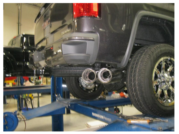
Step 4. Once a final position has been chosen for the new exhaust system, evenly tighten all clamps from front to rear using the torque specifications on page one of the instructions. Inspect all fasteners after 25-50 miles of operation and re-tighten if necessary.

MAGNAFLOW: 22961 Arroyo Vista - Rancho Santa Margarita, CA 92688 | 1(800) 990-0905 Technical Support: 1(800) 959-9226 | Email: moreinfo@magnaflow.com