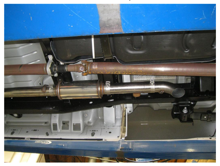
Step 4. Install the Muffler, Tail Pipe Assembly and Extension Pipe Assembly (if needed) using the supplied 3.50" clamps. Locate the welded hangers to the OEM rubber insulators.