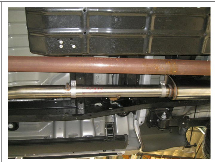
Step 3. Install the Muffler using the supplied 3.50" clamp. Use the supplied 16.00" Extension Pipe between the Muffler and the Tail Pipe Assembly if your truck uses the Crew Cab Long Bed or the Extended Cab Short Bed configuration. If your truck has a Crew Cab with the Short Bed the 16.00" Extension Pipe is not used.

Step 2. Install the new system by attaching the Inlet Y-Pipe Assembly to the OEM catalytic converter outlet pipes using the existing clamp and hardware. Locate the welded hanger to the rubber insulator. Leave all clamps and fasteners loose for final adjustment of the complete system once installed.