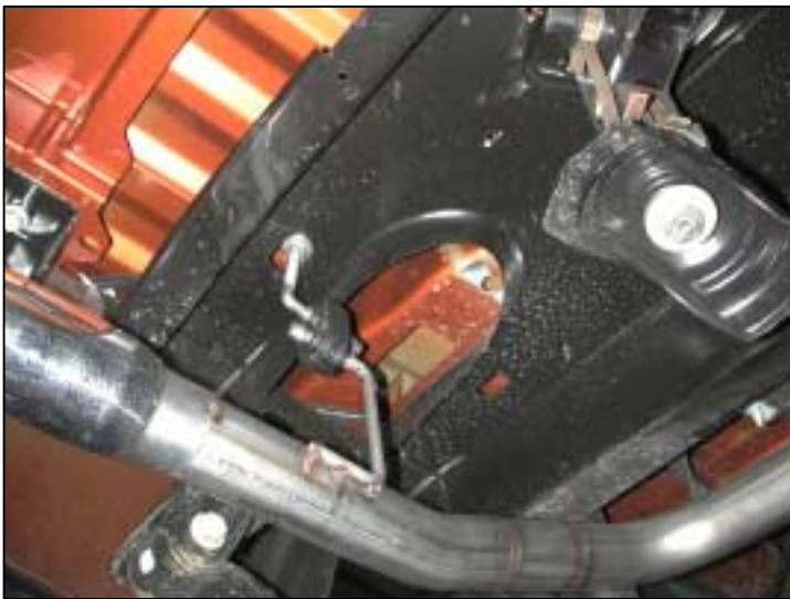
FIG. 2 - Driver's side

Warning: When working on, under, or around any vehicle exercise caution. Please allow the vehicle's exhaust system to cool before removal, as exhaust system temperatures may cause severe burns. If working without a lift, always consult vehicle manual for correct lifting specifications. Always wear safety glasses and ensure a safe work area. Serious injury or death could occur if safety measures are not followed.