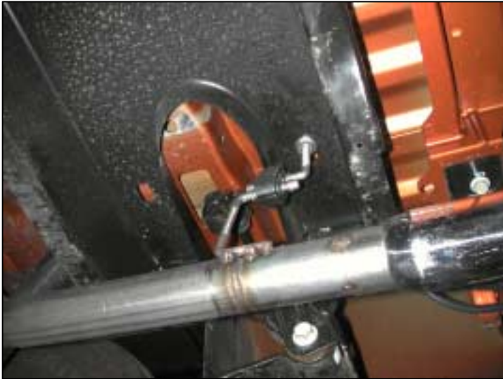
FIG. 1 - Passenger's side