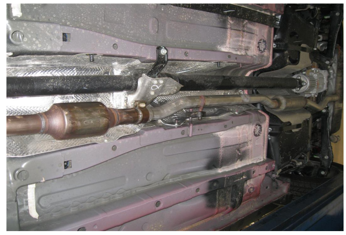
Step 1. to remove the OEM exhaust system, unbolt the clamp at the catalytic converter. Disengage the welded hangers from the rubber isolators and remove the complete exhaust system.