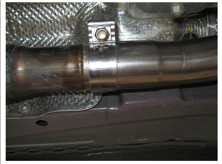
Step 2. Begin installation of your new system by fitting the Inlet Pipe Assembly to the catalytic converter outlet. Locate the welded hanger to the rubber isolator. Secure using the supplied clamp. Leave all clamps loose for final adjustment.