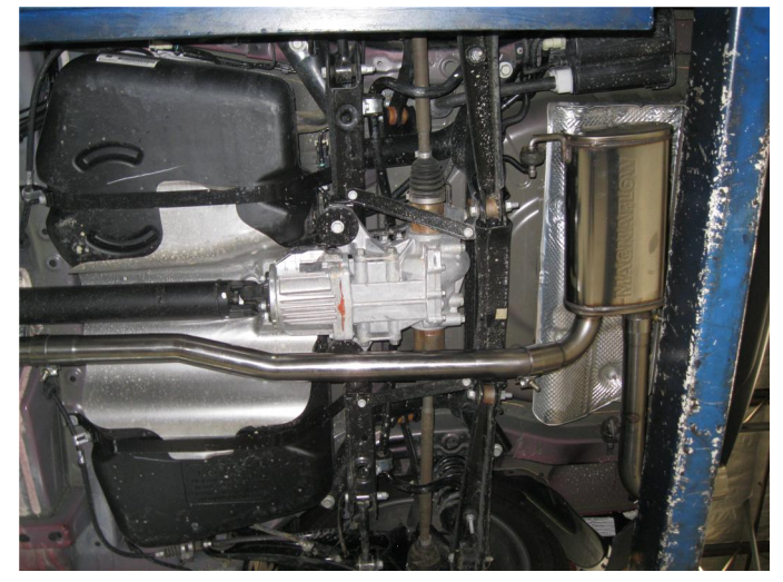
Step 3. Install the Mid Pipe, Muffler and Tail Pipe Assemblies in a similar fashion.