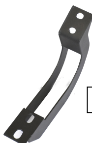
Middle & Rear Bracket