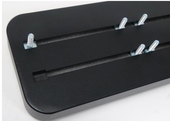
(Fig 2) Slip M6 T-bolts into the bottom channel