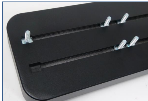
Fig 3 Slip M6 Square Head Bolts into channel