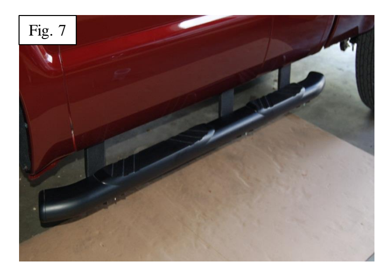
Step 6: Check that all brackets are tight before stepping on boards.

Step 5: Fully tighten brackets to the vehicle. The slots in the brackets allow for <sup>3</sup>/<sub>4</sub>" of height adjustment. Keeping the running board level with the vehicle, set to the desired height and fully tighten brackets at this time.