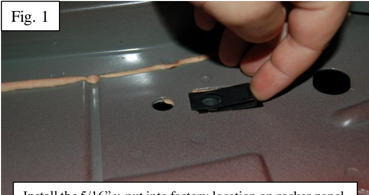
Install the 5/16" u-nut into factory location on rocker panel

Step 1: Find the mounting locations on the inside rocker panel and the pinch weld of the vehicle. Starting at the front, install (1) 5/16° u-nut in factory location, see Figure 1&2 , Using 5/16°x3/4° zinc hex bolt and washer mount bracket to vehicle. Next add the black 5/16°x1° flange bolt through the front side of the pinch weld and fasten with a washer and flange nut. Do not fully tighten at this time. See figure 3 .